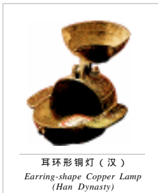
耳环形铜灯（汉） Earring-shape Copper Lamp (Han Dynasty)

当今淮安的食品、纺织、建材、化工和冶金、机械、能源等产业有较强的实力，各类专业市场繁荣兴旺，已成为江淮明珠。她正穿越历史文化的时空，演绎着吴风楚韵，向着经济强市和旅游大市迈进。