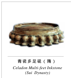
青瓷多足砚（隋） Celadon Multi-feet Inkstone (Sui Dynasty)

The food, textile, building materials, chemical, metallurgy, mechanical and energy source industries of Huai'an are performing well. Huai'an is running through the space-time of history and culture, rushing on the expressway.