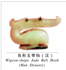
凫形玉带钩（汉） Wigeon-shape Jade Belt Hook (Han Dynasty)

从古至今，淮安先后涌现了一大批军事家、政治家、思想家、文学家、科学家和艺术家。如“兴汉三杰”之一的韩信，南宋抗民族英雄梁红玉，清代民族英雄关天培，汉辞赋家枚乘、枚乘父子，画家龚开、扬州八怪之一的边寿民，《西游记》作者吴承恩，《老残游记》作者刘鹗等。近代有京剧“四大名旦”的宗师王瑶卿，京剧“麒派”创始人周信芳，雕塑大