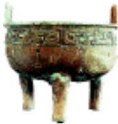
穷曲纹铜鼎（春秋） Copper Pot (Spring and Autumn Period)

淮安，即取淮水安澜之意，夏周为“淮夷”，“徐夷”聚居地。春秋战国时期，先后属吴、越、楚国。秦代始置淮阴县，隋代称楚州，东晋置山阳郡，南宋升为淮安州，明、清为淮安府。