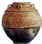
莲瓣四系青瓷罐（南北朝） Lotus Petal Green Porcelain Jar (Northern and Southern Periods)

A pattern of three conjoint parts of Huai'an, consisting of the old city, the new and the mid one, which claims the exclusive one in China, had come into being since the Song Dynasty. An axes, on which the Zhenhuai