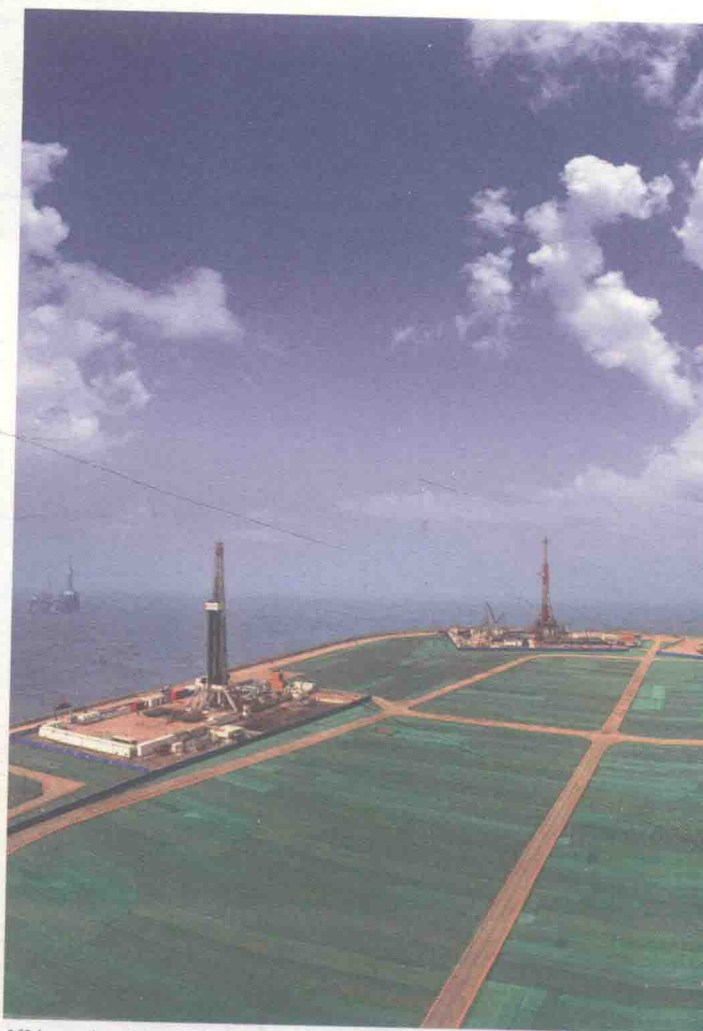
Offshore oil exploitation area

Hebei has four coal mining areas (Tangshan, Handan, Xingtai, and Yuzhou), and three oil fields: Huabei (North China), Jidong (East Hebei), and Dagang. Its onshore wind energy reserves total 74 million kw and