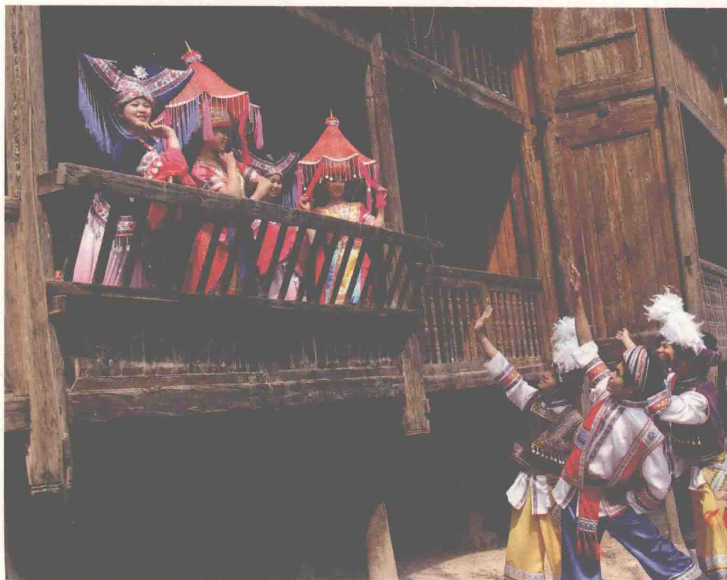
Yesanpo Minorities Park, Baoding

The 2 million religious believers in Hebei follow five major religions: Buddhism, Daoism, Islam, Catholicism, and Protestant Christianity. They account for about 3% of the total population of the province. Of them, there are about 1 million Catholics, taking up 25% of the national total; 200,000 followers of Chinese Buddhism, 150,000 followers of Tibetan Buddhism, over 20,000 followers of Daoism, and 500,000 Muslims.