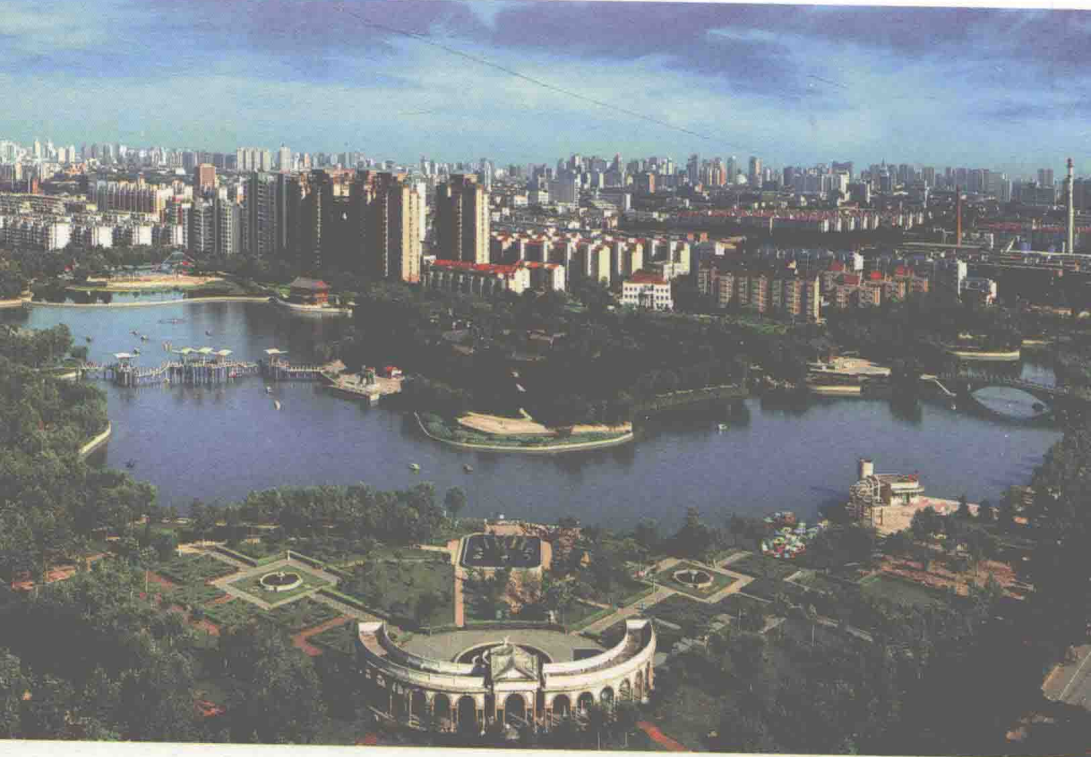
The provincial capital - Shijiazhuang

Hebei is located in the north of China's eastern coastal region, lying in the north of the North China Plain, and spanning the southeastern Inner Mongolia Plateau. Beijing and Tianjin municipalities are carved out of Hebei. Hebei borders the Bohai Sea on the east, and its western part rises into the Taihang Mountains, while the Yanshan Mountains run through the north of the province. The Zhanghe River flows across the southeast. Hebei borders Liaoning to the northeast, Inner Mongolia to the north, Shanxi to the west, Henan to the south, and Shandong to the southeast.