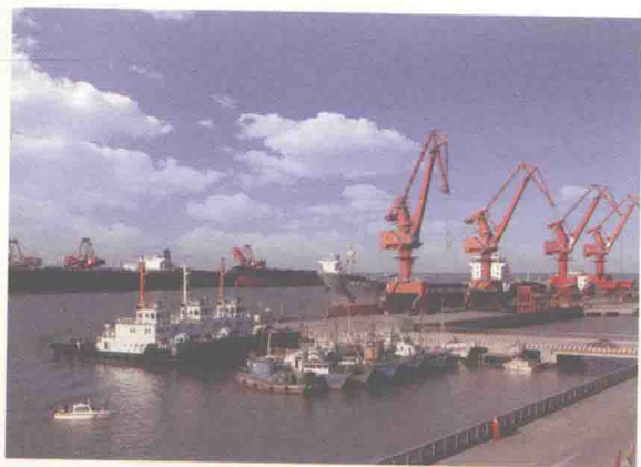
Huanghua Port, Cangzhou