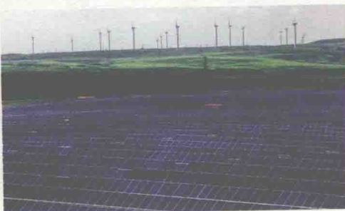
National Wind and PV Energy Storage and Transmission Demonstration Project in Bashang, Zhangjiakou