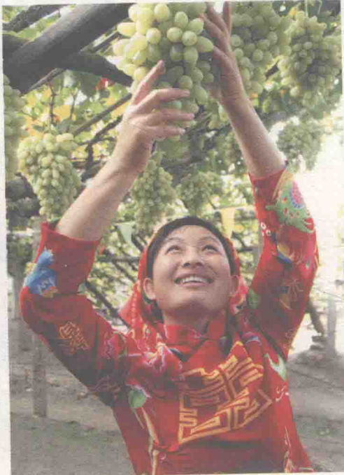
Xuanhua grapes, Zhangjiakou