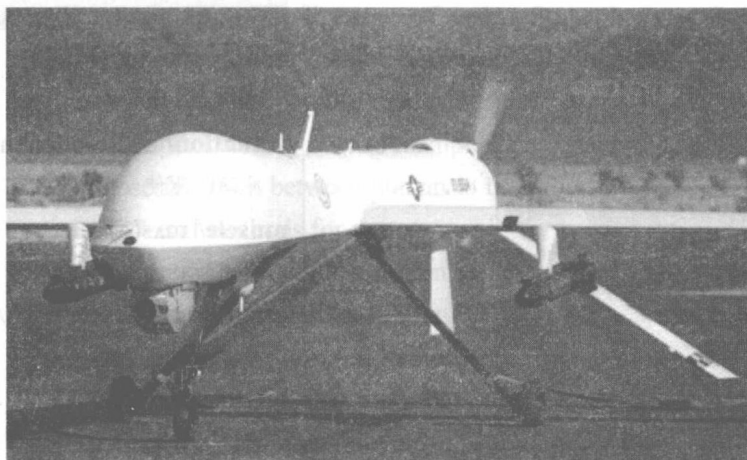
Figure 1-1 Introduction of Robotics: Military robots