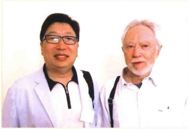
I . Author and J. M. Coetzee