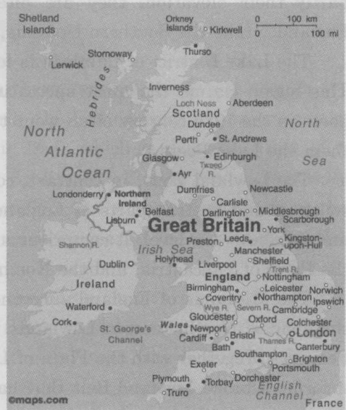
Map of UK

The Pennines start on the border of England and Scotland and run about 120 kilometers south to central England. Partly because of their length and