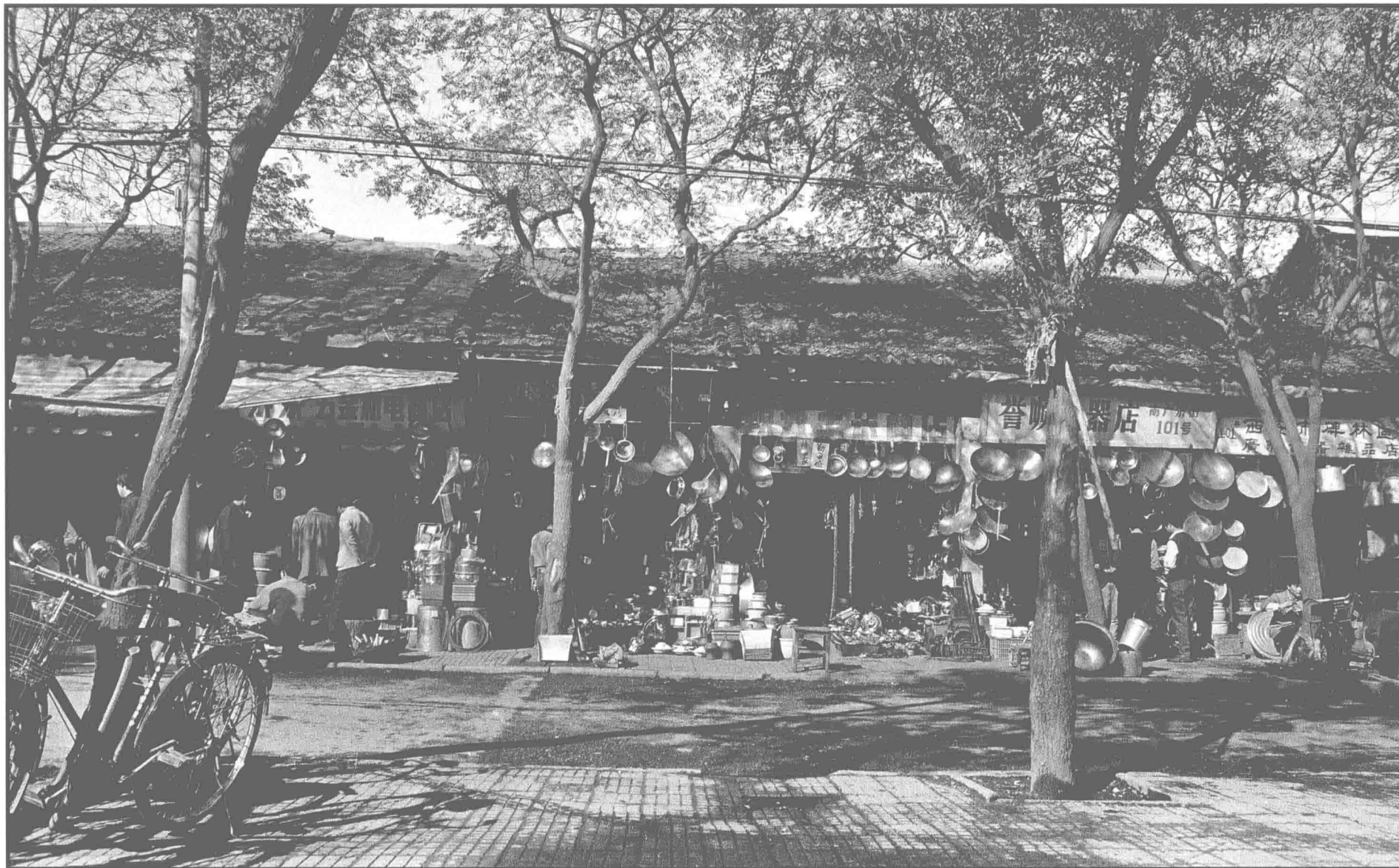
广济街 成排的五金店 1988年

Guangji Street A Row of Hardware Stores 1988