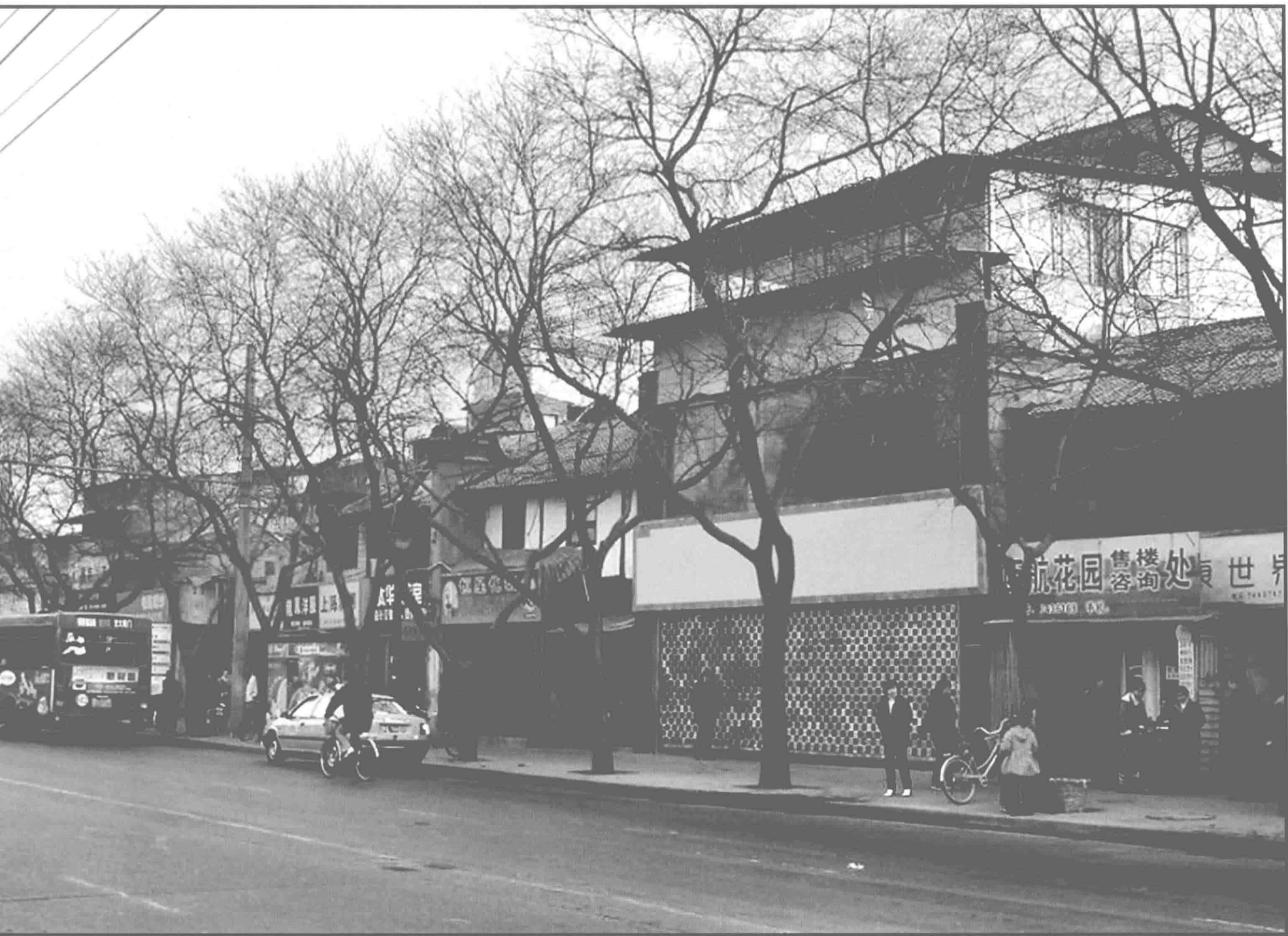
老东大街 街景 20世纪90年代