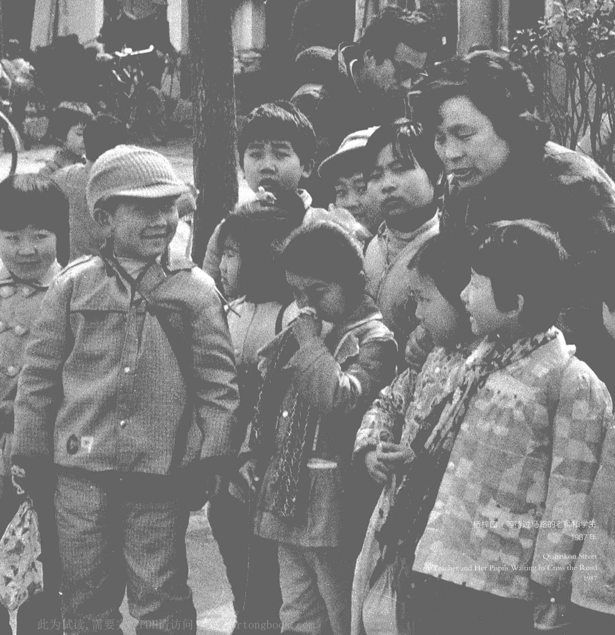
桥梓口 等待过马路的老师和学生 1987年

Qiaozikou Street A Teacher and Her Pupils Waiting to Cross the Road 1987