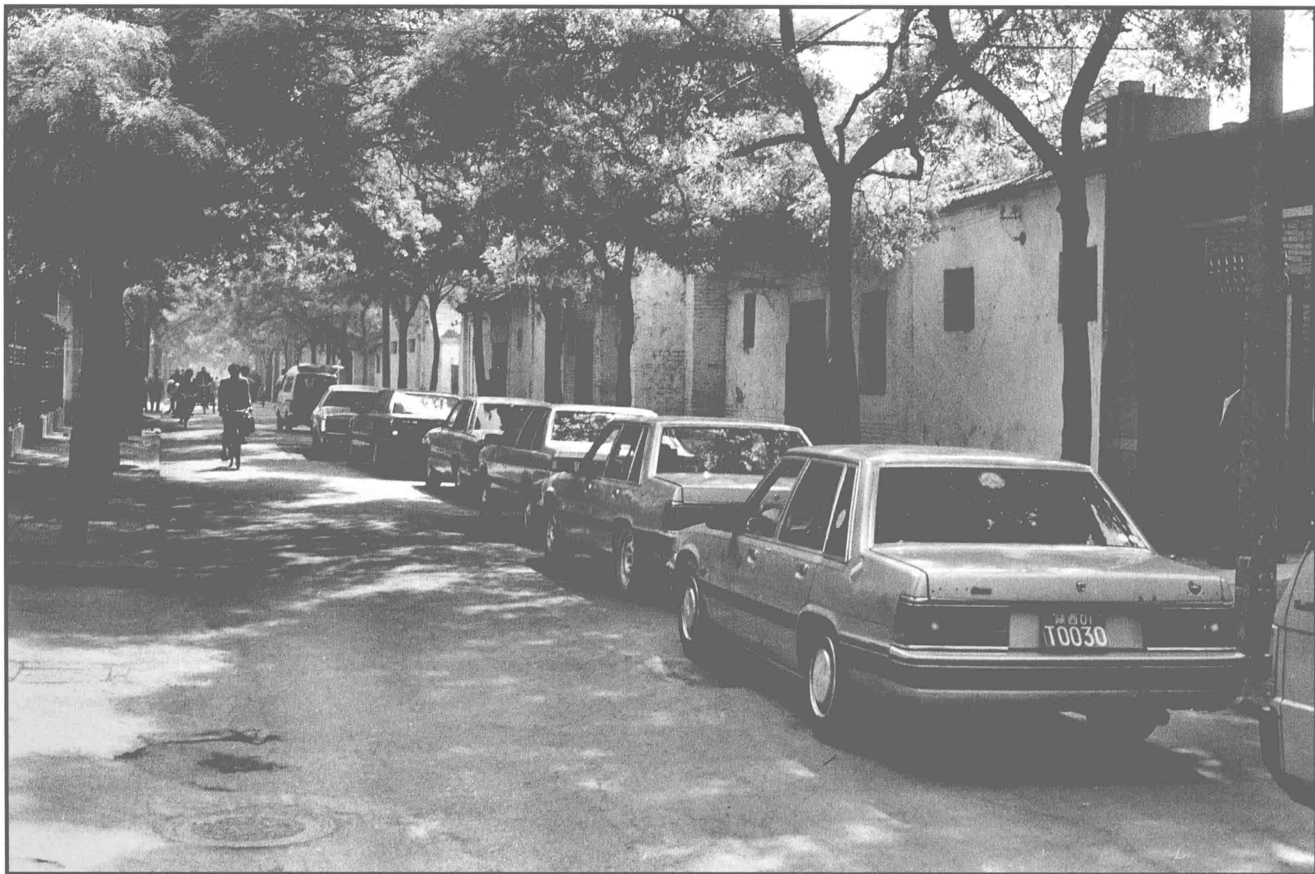
八路军驻陕办事处附近 街景 1988年

Street Scene near the Eight Route Army Office in Xi'an 1988