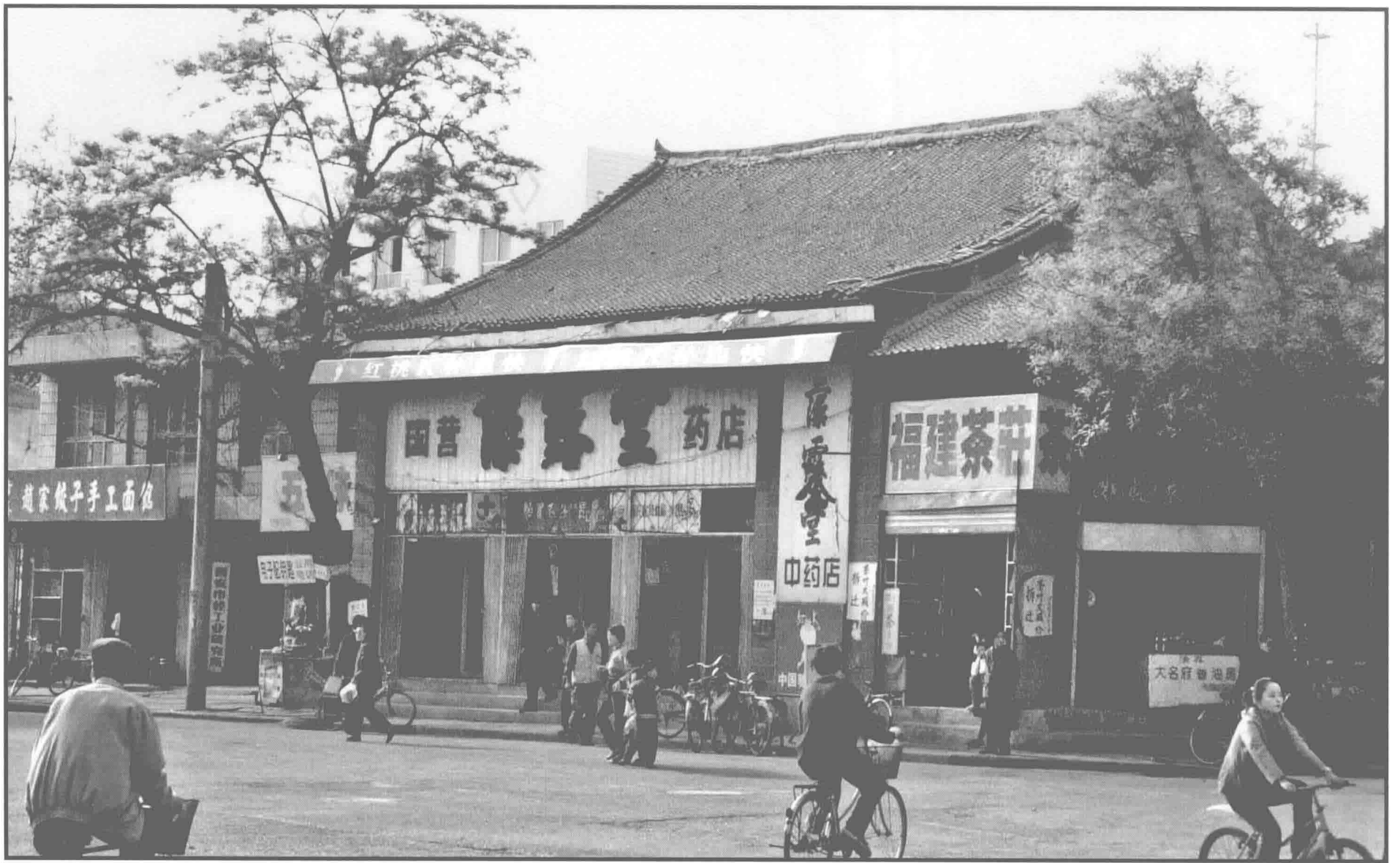
五味什字 藻露堂药店门前 1989年

Wuweishizi Street Zaolutang Drugstore Frontage 1989