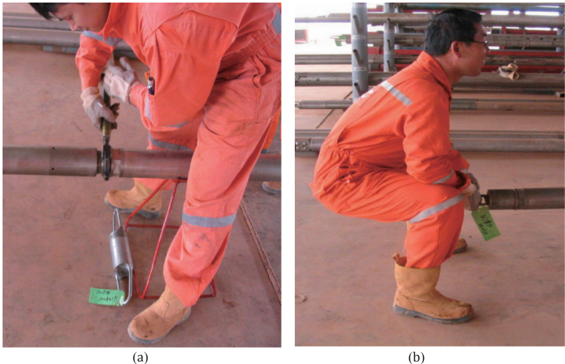
Figure 1.2 Connect the toolstring

Step2: Judge the size of the working area and decide where to lay the toolstring, then connect the toolstring starting from the bottom tool, as shown in Figure 1.2.