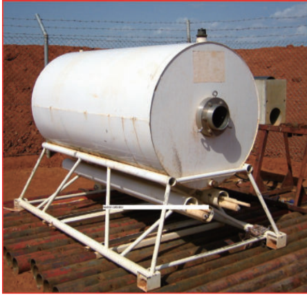
Figure 1.5 Neutron calibrator

Step1: Inspect the condition of the calibrators to be used. Locate the radioactive sources if they are needed, leave them in the sources pit. Calibration Equipments are shown in Figure 1.5 and Figure 1.6.