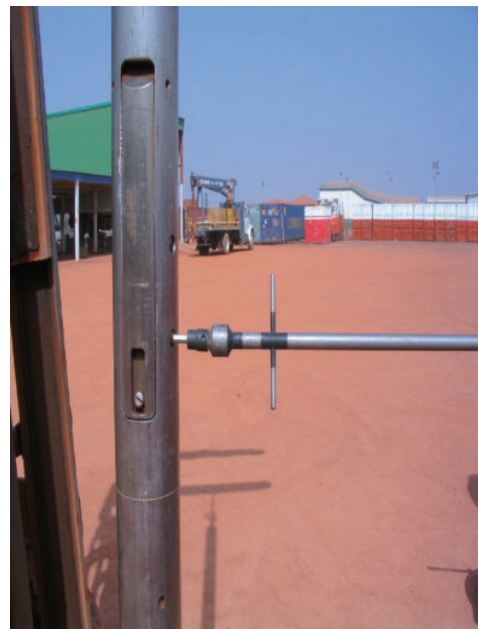
Figure 1.12 Ensure the source is caught tightly