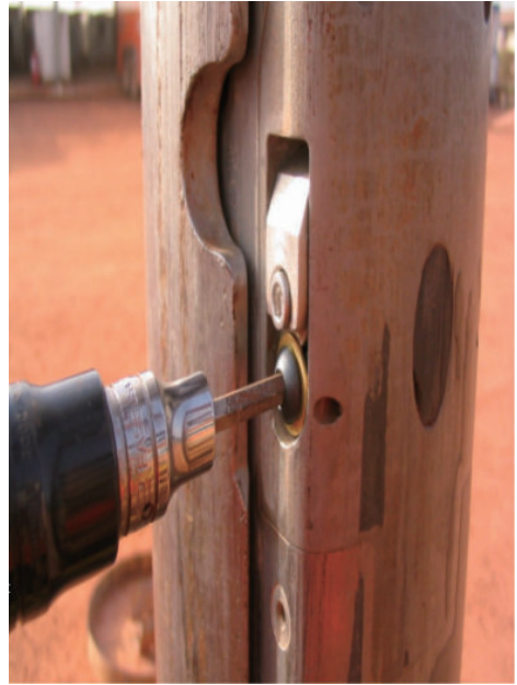
Figure 1.13 Screw in the lock-screws

In correctly working tools, deviations from the averages can be traced and should be very small for a particular tool. So it must be noticed if the calibration is in tolerance but the tool response has been shifted from previous status, the reason to cause change must be addressed.