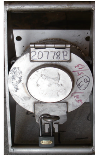
Figure 1.10 Density source w/ shielding container

(3) Unlock the source shielding container, catch the source with source loading tool. The operation is shown in Figure 1.11.