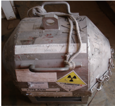
Figure 1.9 Neutron source w/ shielding container