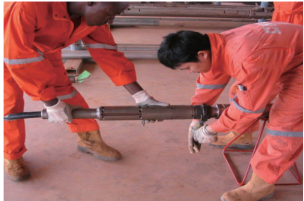
Figure 1.4 Connect the test boxes to the corresponding tools