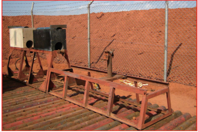
Figure 1.6 Density calibrator

Step2: Connect the tool to be calibrated in the calibrating area, position or attach the calibrator to the tool if it's required, and attach the cablehead to be ready for tool power up. A calibrator example is shown in Figure 1.7.