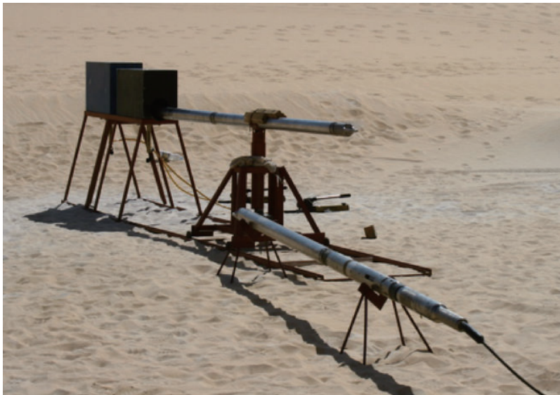
Figure 1.7 The density tool is ready for calibration

Step2: Connect the tool to be calibrated in the calibrating area, position or attach the calibrator to the tool if it's required, and attach the cablehead to be ready for tool power up. A calibrator example is shown in Figure 1.7.