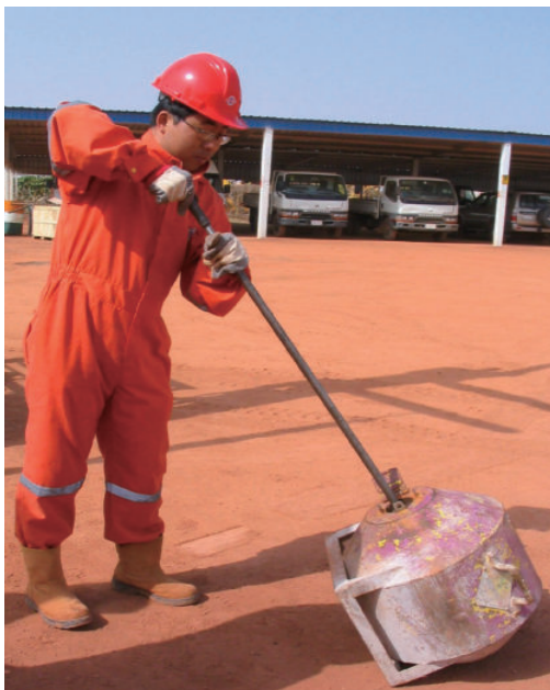
Figure 1.11 Unlock the source shielding container

(4) Ensure the source is caught tightly, pull it out of the container and insert it in the tool. The operation is shown in Figure 1.12.