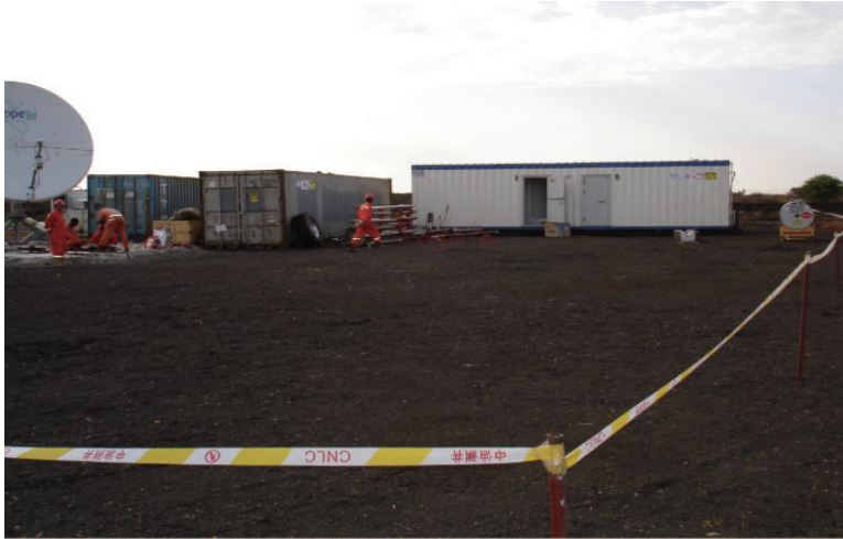
Figure 1.8 Warning sign