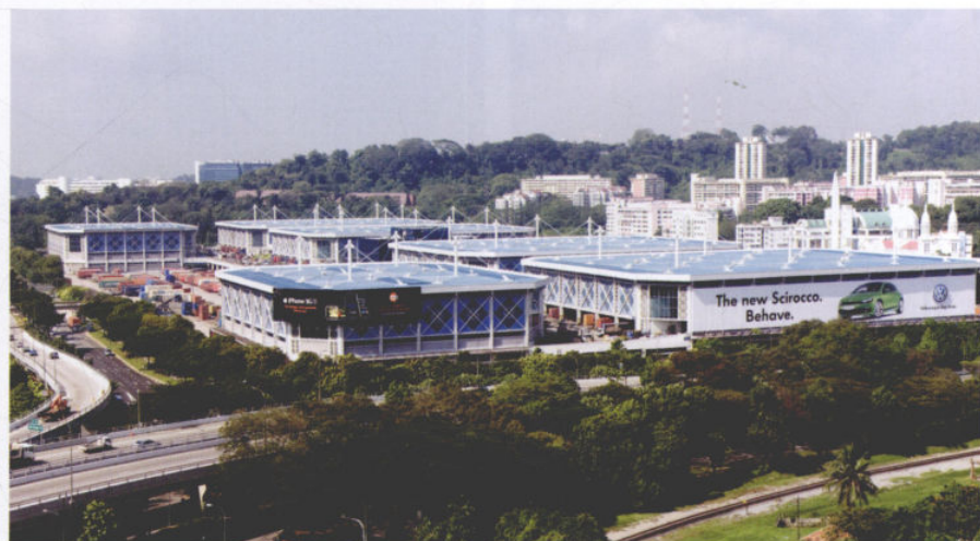
新加坡吉宝物流集散中心 Singapore Keppel District Park