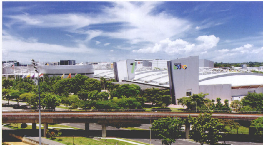
新加坡国际会展中心 Singapore International Convention & Exhibition Centre

China Jingye Engineering (CJY) is a comprehensive high-tech enterprise. It is a technology leader in China's civil engineering and environmental protection industries. It is qualified to provide professional services for engineering design, engineering survey, engineering supervision, engineering consulting, environmental assessment engineering, special engineering, etc. MCC is the controlling shareholder of CJY.