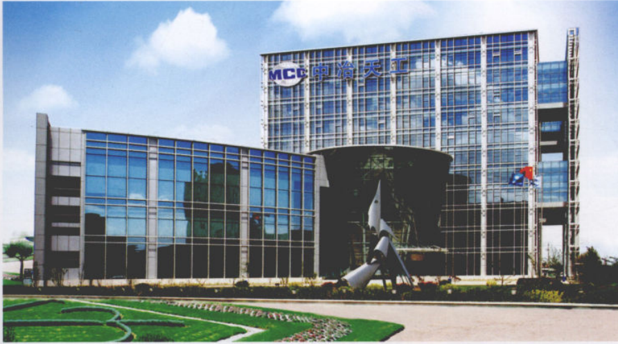
中冶天工办公楼 CMTCC's office

China Metallurgical Tiangong Construction Co.