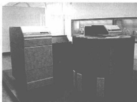
Figure 1-4 Cray designed many supercomputers that used multiprocessing heavily

resources at once. Supercomputers usually see usage in large-scale simulation ⑩ , graphics rendering, and cryptography applications, as well as ⑪ with other so-called ⑫ “ embarrassingly ⑬ parallel” tasks. ⑭