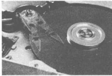
Figure 1-3 Hard disk drives are common storage devices used with computers

I/O is the means by which a computer exchanges information with the outside world. Devices that provide input or output to the computer are called peripherals. ① On a typical personal computer, peripherals include input devices like the keyboard and mouse, and output devices such as the display and printer. ⑩ Hard disk drives ⑫ shown as Figure 1-3, floppy disk drives ⑬ and optical disc ⑭ drives serve as both input and output devices. Computer networking is another form of I/O.