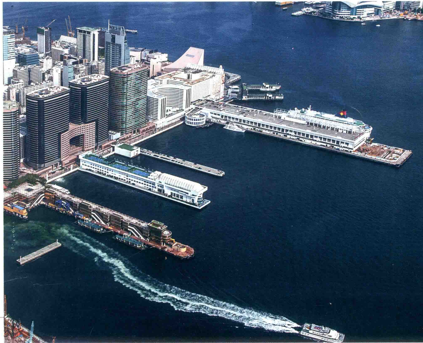
香港海港城 Harbour City of Hong Kong.