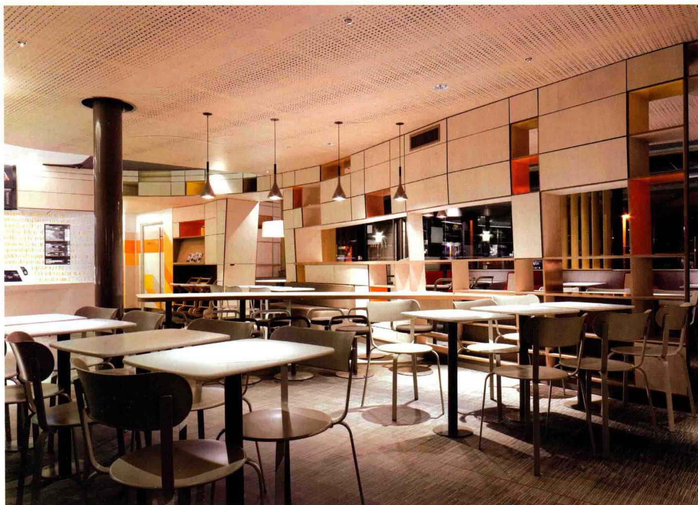
McDonald Concept Racine in Villefranche-de-Lauragais, France 麦当劳概念店，法国洛拉盖自由城

若要成功打造一个连锁快餐厅，睿智的经营者应该熟知其涉及的每个方面，从选址到建造再到设计，所有的环节必须融合在一起。即便如此，这并不意味着从最初构思到餐厅营业能够一帆风顺，但是越是精心策划，成功的几率就会越高。