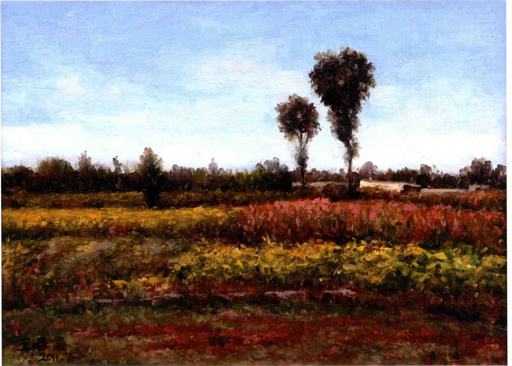
秋 布面油画 30cm×40cm 2011年 Autumn Oil on Canvas 30cm×40cm 2011