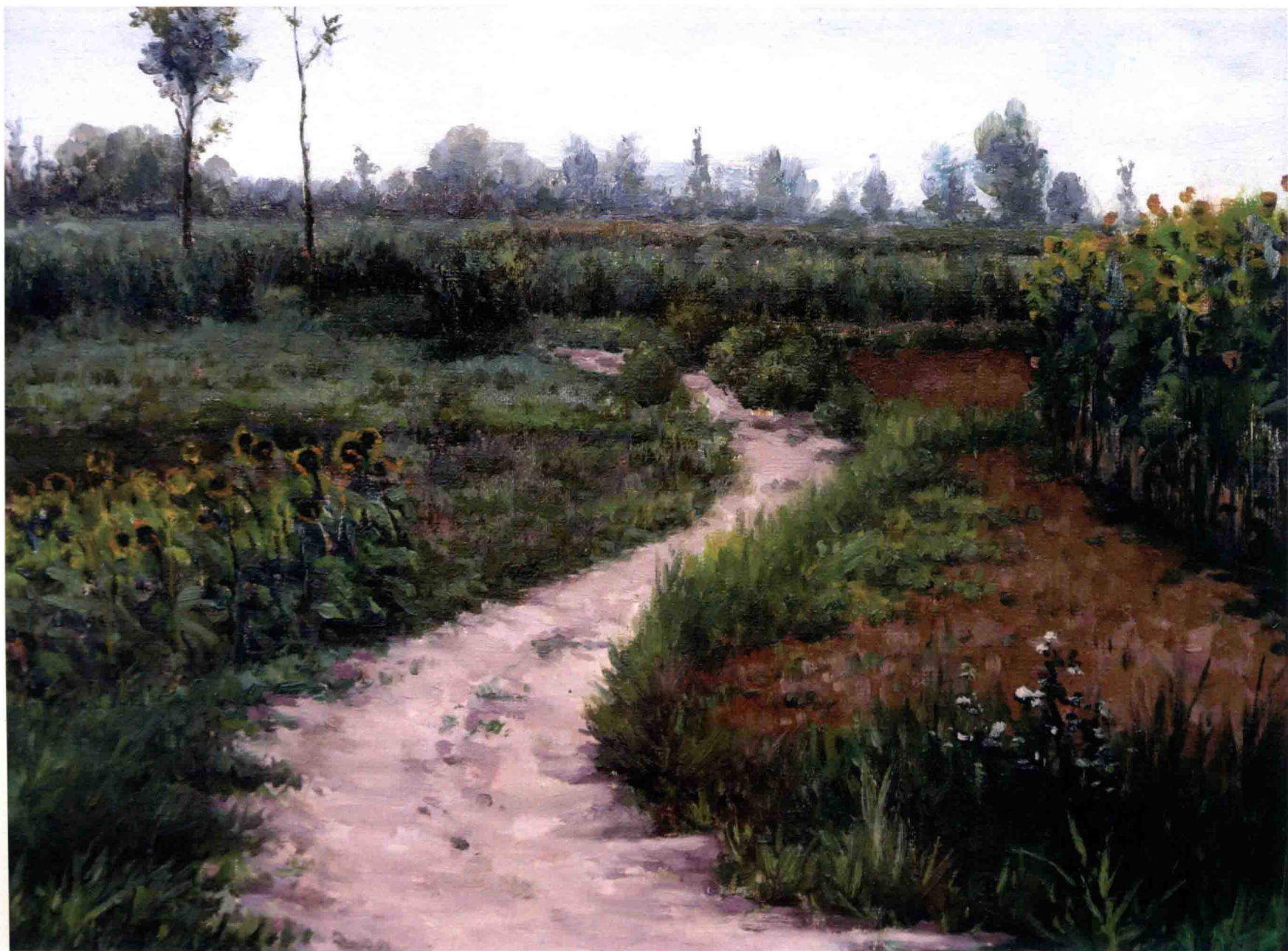
夏 布面油画 30cm×40cm 2011年 Summer Oil on Canvas 30cm×40cm 2011