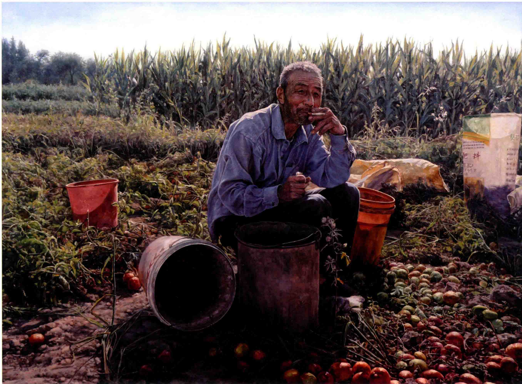
农民的梦 布面油画 97cm×130cm 2014年 A Farmer's Dream Oil on Canvas 97cm×130cm 2014