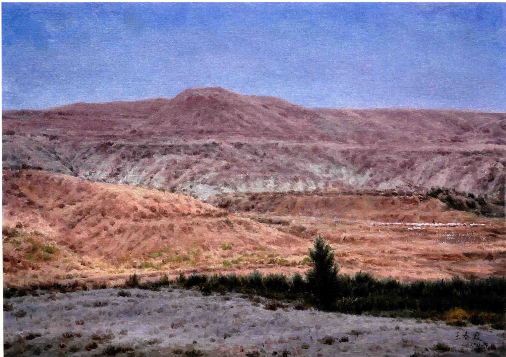
宁静 布面油画 50cm × 70cm 2013 年 Tranquility Oil on Canvas 50cm × 70cm 2013