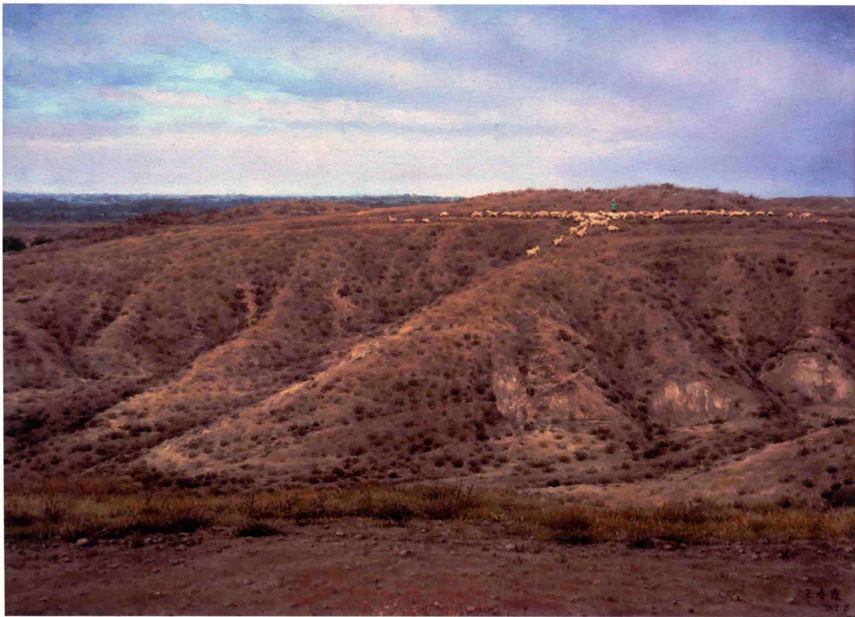
五哥放羊 布面油画 72.7cm×100cm 2013年 Shepherd Oil on Canvas 72.7cm×100cm 2013