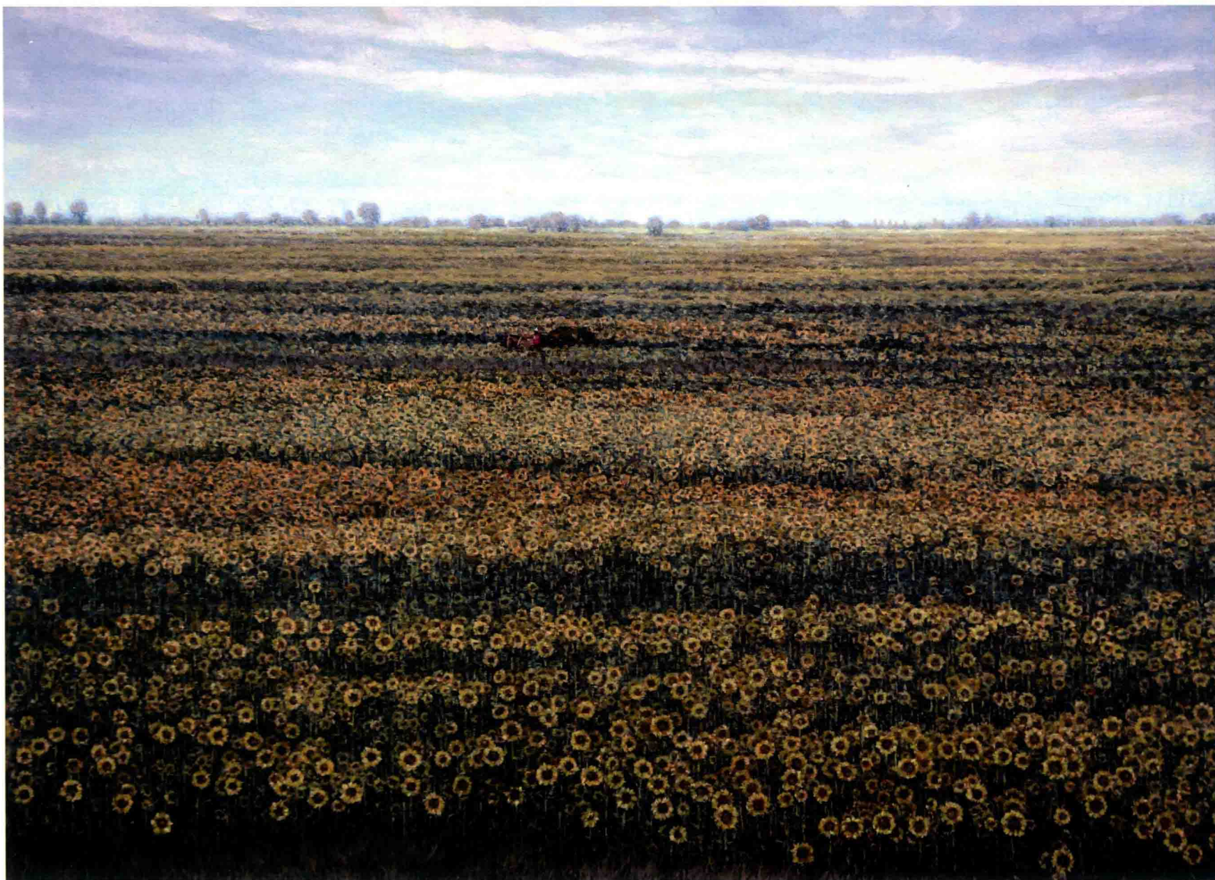
葵乡 布面油画 94cm × 130cm 2013年 Sunflowers Oil on Canvas 94cm × 130cm 2013