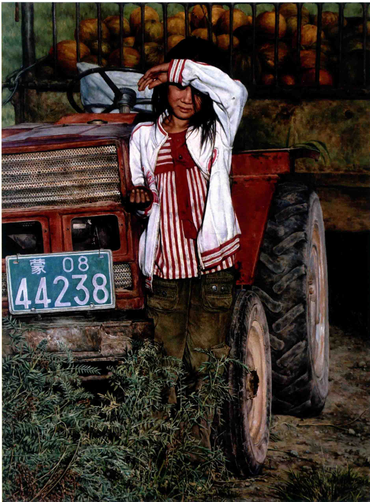
村里的娃 布面油画 130cm × 97cm 2014年 Village Kids Oil on Canvas 130cm × 97cm 2014