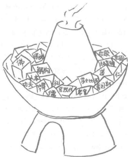
文化“火锅”，既美味又营养

You should write neatly on ANSWER SHEET 2. (20 points)