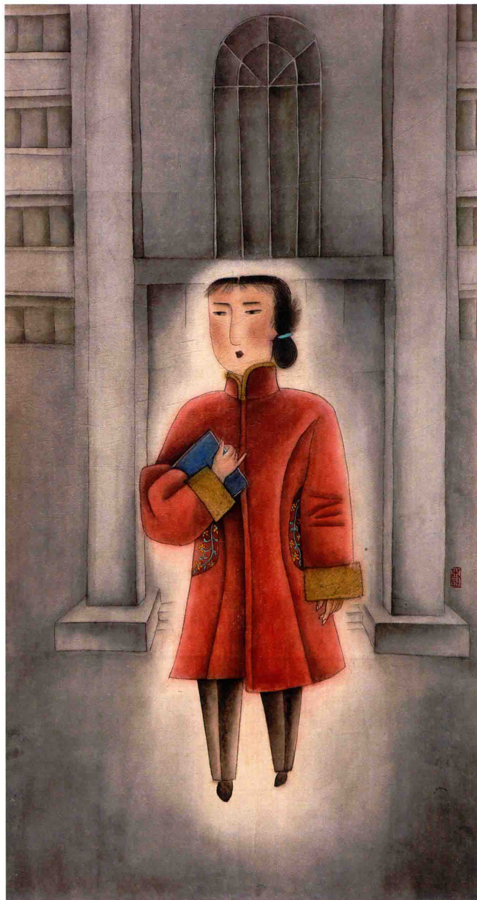
忆 纸本 65cm × 45cm Memories Paper Painting 65cm × 45cm