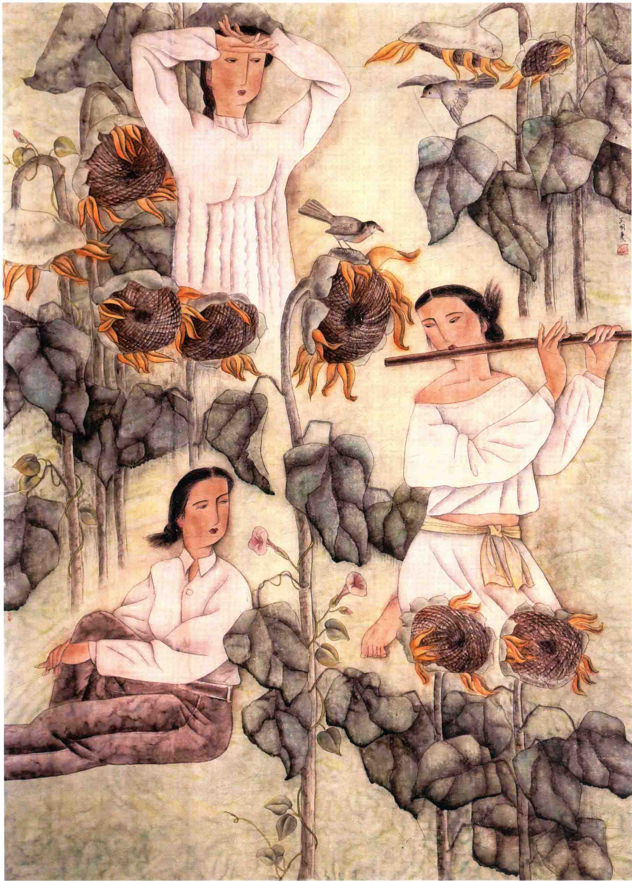
河套秋声 纸本 170cm × 150cm Hetao in Autumn Paper Painting 170cm × 150cm