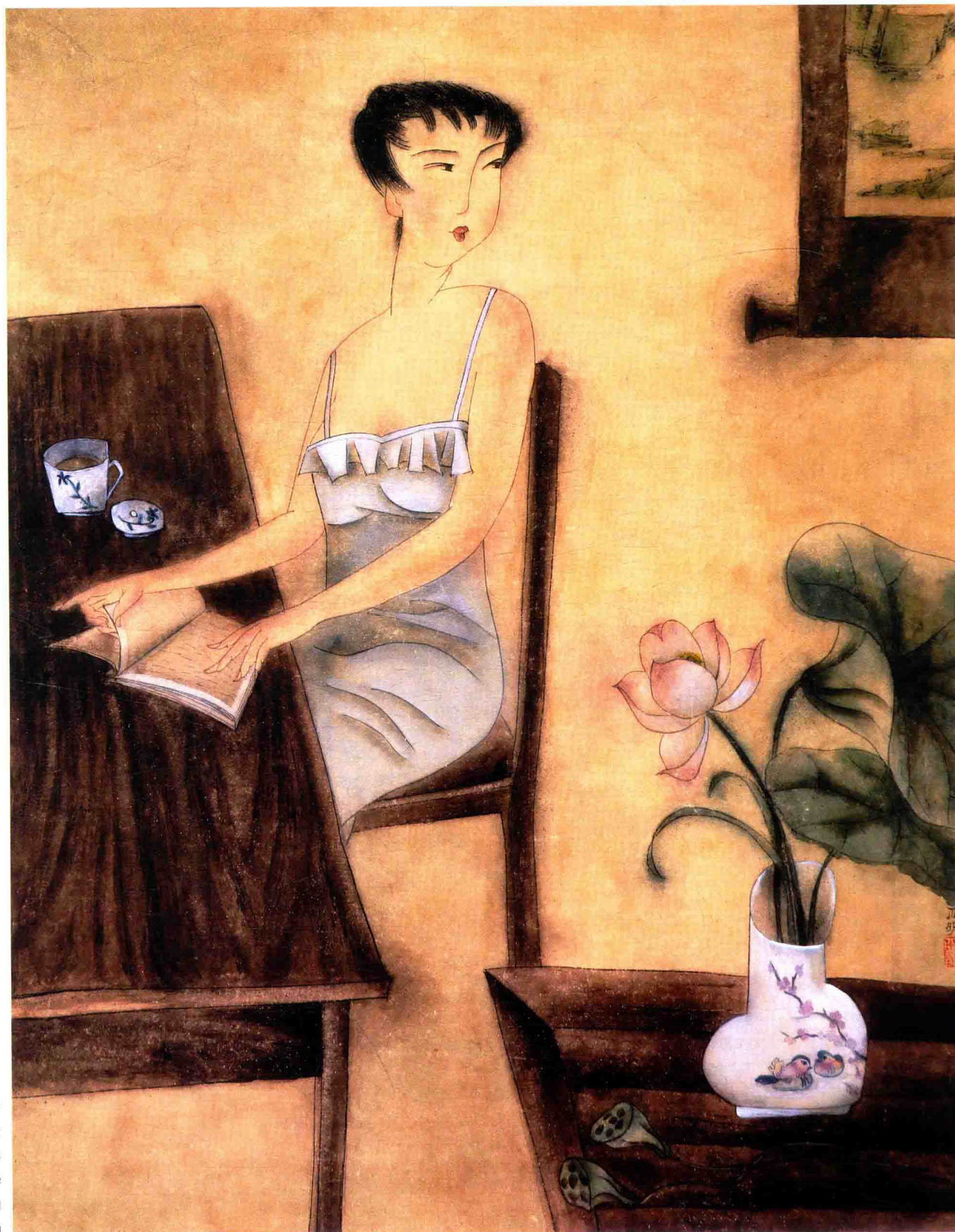
馨 纸本 60cm × 48cm Fragrance Paper Painting 60cm × 48cm