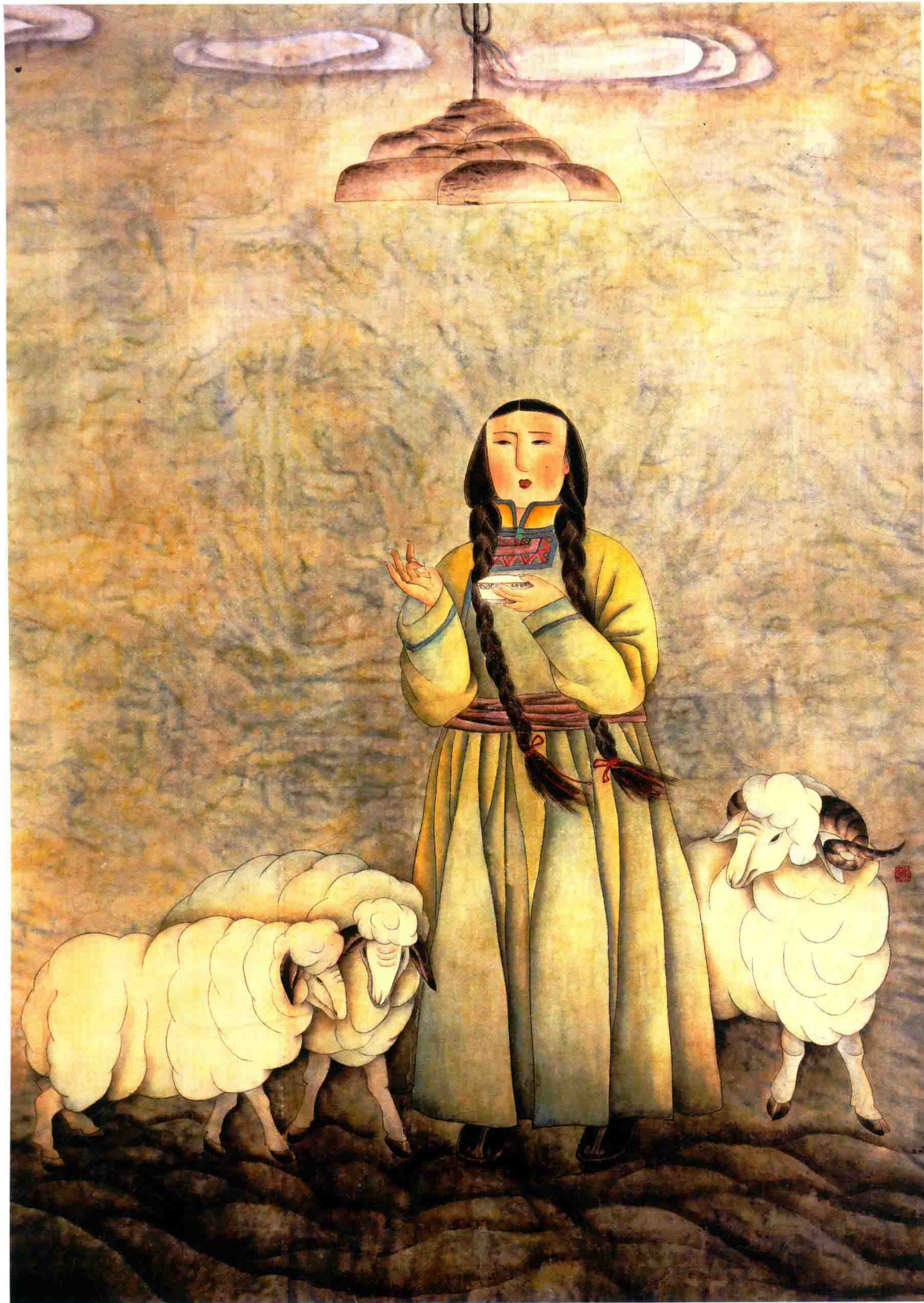
天地敬 纸本 170cm × 150cm Heaven and Earth Paper Painting 170cm × 150cm