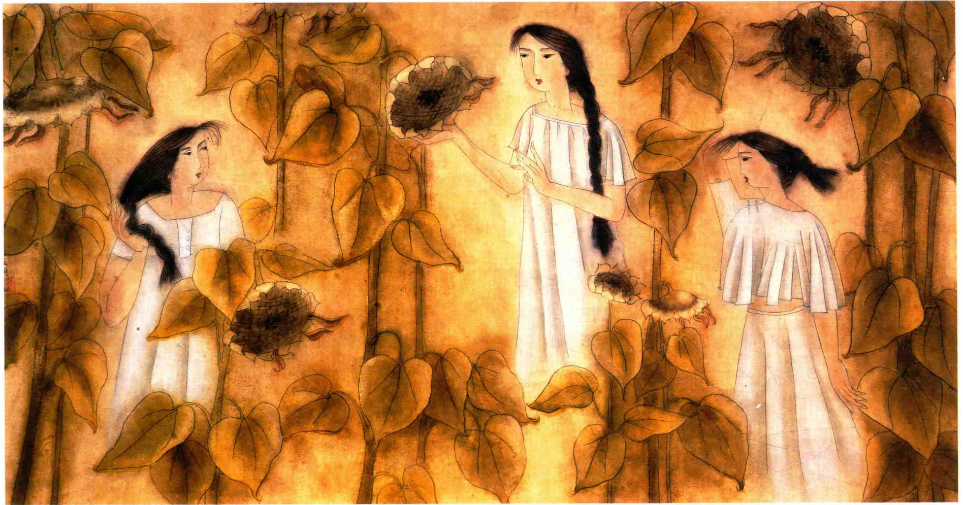
秋韵 纸本 45cm × 69cm