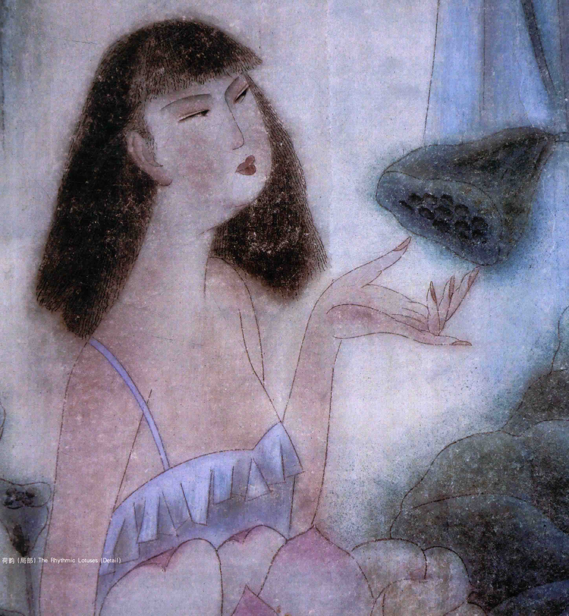
荷韵 (局部) The Rhythmic Lotus (Detail)