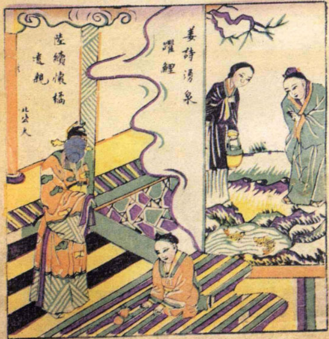
1-1 二十四孝图 112 × 30cm 清代 木版套印 Illustrated Twenty-four Cases of Filial Piety 112 × 30 cm, Qing Dynasty, Wood block process printing