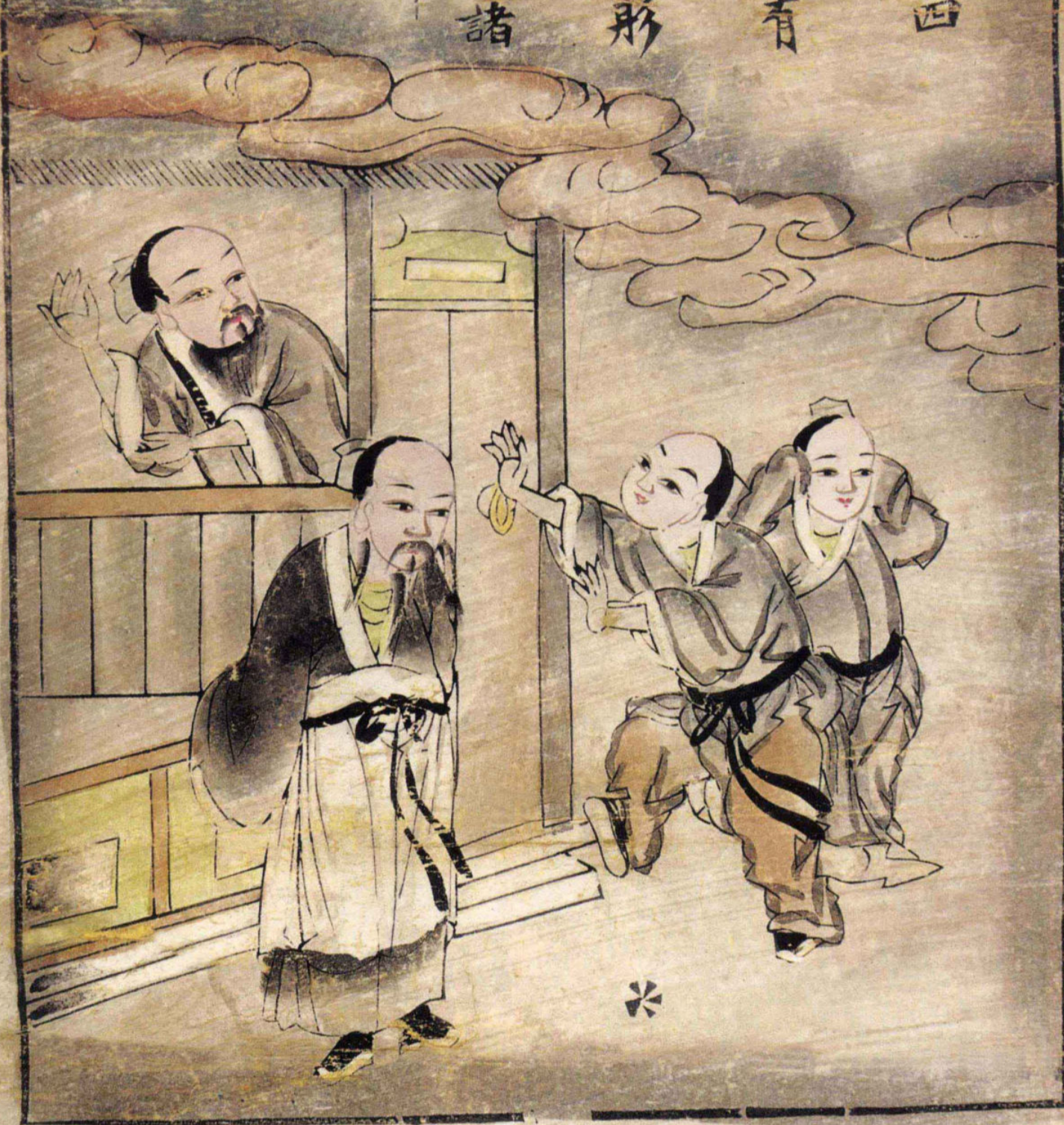
4—8 二十四梯图 (局部) 106 × 26cm 清代 半印半绘 Illustrated Twenty-four cases of respect for one's elder brother (Detailed) 106 × 26 cm, Qing Dynasty, semi-printed and semi-drawn

繆彤自過 後漢繆彤兄弟四 人同居及各娶 妻遂求分異數有 爭鬪之言彤乃 閉戶自過曰繆彤 汝修身謹行奈 何不能正家乎諸 弟聞之皆謝罪 尤人之不應 咎己之堪嗟 一室惟彤長 高門且自過