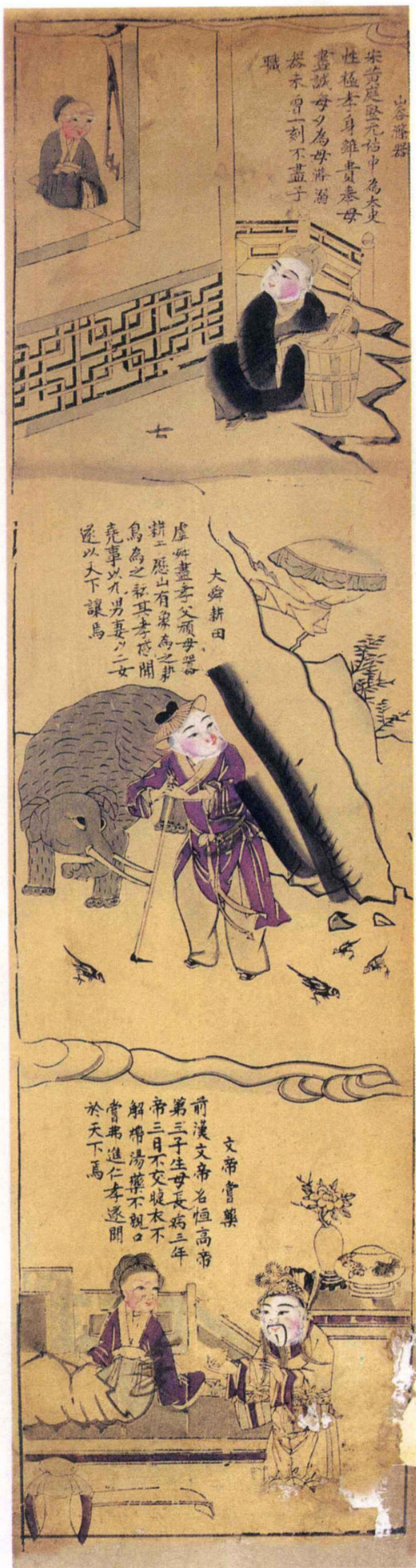
2-7 二十四孝图 103 × 30cm 清代 半印半绘 Illustrated Twenty-four Cases of Filial Piety 103 × 30 cm, Qing Dynasty, semi-printed and semi-drawn