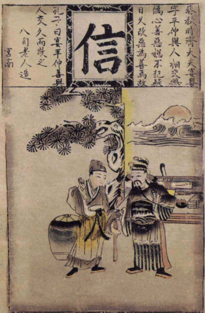
3—1 礼义忠孝图 105 × 26cm 清代 半印半绘 Illustrated Cases of Courtesy, Justice, Loyalty and Filial Piety 105 × 26 cm, Qing Dynasty, semi-printed and semi-drawn