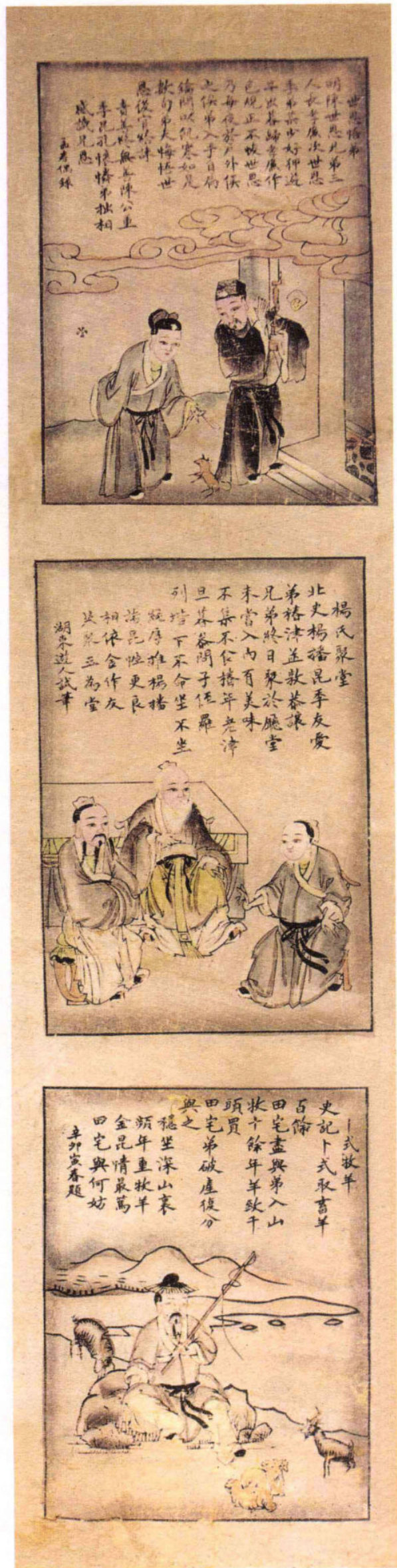
4-4 二十四梯图 106 × 26cm 清代 半印半绘 Illustrated Twenty-four cases of respect for one's elder brother 106 × 26 cm, Qing Dynasty, semi-printed and semi-drawn