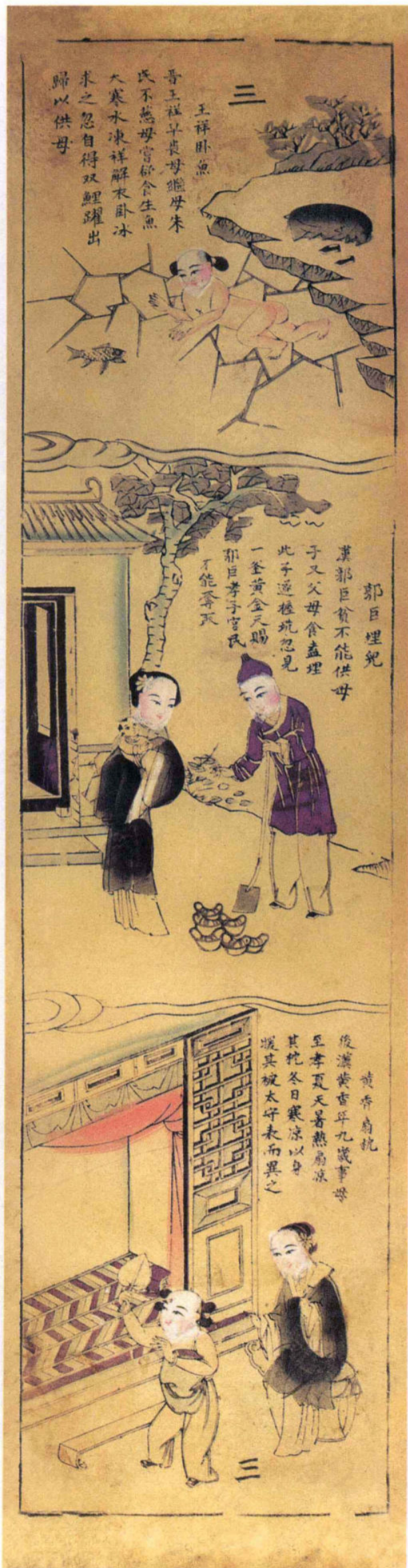
2-3 二十四孝图 103 × 30cm 清代 半印半绘 Illustrated Twenty-four Cases of Filial Piety 103 × 30 cm, Qing Dynasty, semi-printed and semi-drawn