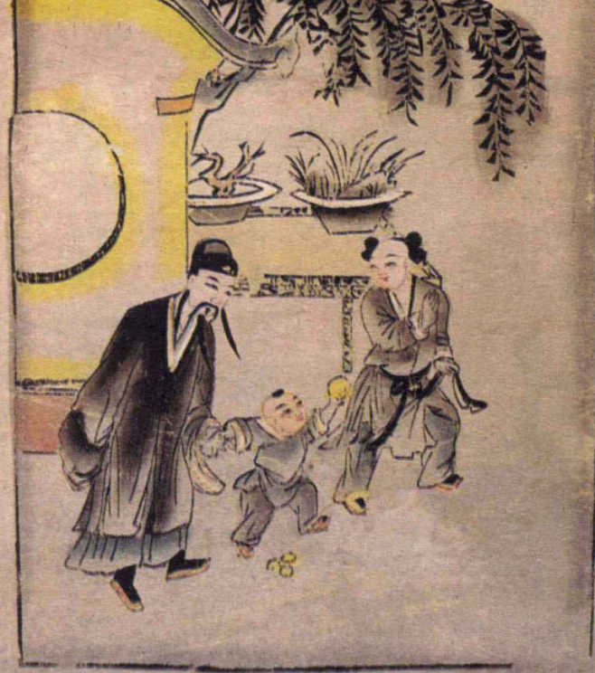
3-3 礼义忠孝图 105 × 26cm 清代 半印半绘 Illustrated Cases of Courtesy, Justice, Loyalty and Filial Piety 105 × 26 cm, Qing Dynasty, semi-printed and semi-drawn

弟 東漢孔融方四歲喜 蓋弟道父母甚愛之 一日父將梨數個撒 在地下使融分梨與 眾兄融自食小者與 兄大者父問曰汝何 食小不吃大對曰兄 長食大余幼食小