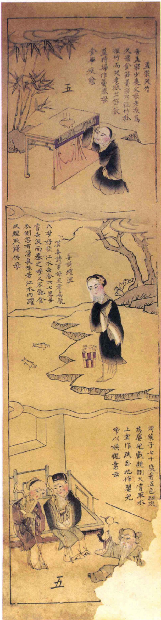
2-5 二十四孝图 103 × 30cm 清代 半印半绘 Illustrated Twenty-four Cases of Filial Piety 103 × 30 cm, Qing Dynasty, semi-printed and semi-drawn