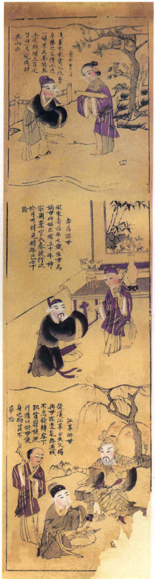
2-4 二十四孝图 103 × 30cm 清代 半印半绘 Illustrated Twenty-four Cases of Filial Piety 103 × 30 cm, Qing Dynasty, semi-printed and semi-drawn