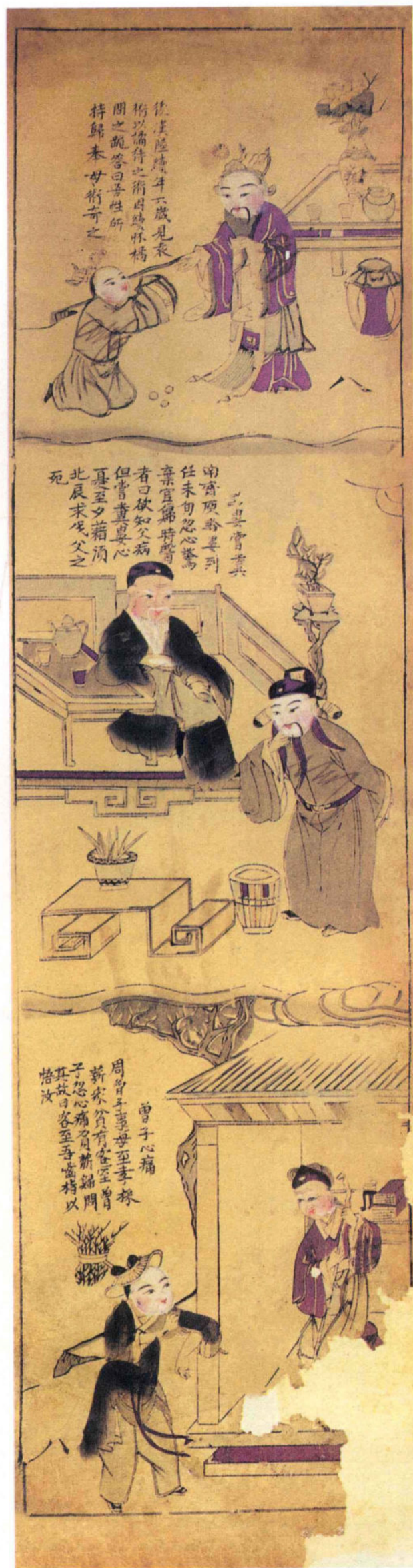
2-8 二十四孝图 103 × 30cm 清代 半印半绘 Illustrated Twenty-four Cases of Filial Piety 103 × 30 cm, Qing Dynasty, semi-printed and semi-drawn