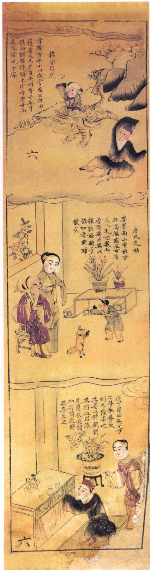
2-6 二十四孝图 103 × 30cm 清代 半印半绘 Illustrated Twenty-four Cases of Filial Piety 103 × 30 cm, Qing Dynasty, semi-printed and semi-drawn