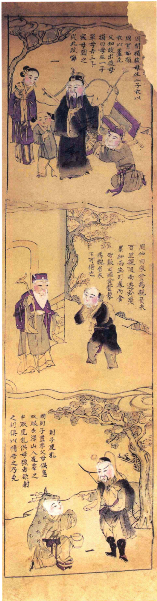
2-1 二十四孝图 103 × 30cm 清代 半印半绘 Illustrated Twenty-four Cases of Filial Piety 103 × 30 cm, Qing Dynasty, semi-printed and semi-drawn