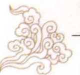
1-2 二十四孝图 112 × 30cm 清代 木版套印 Illustrated Twenty-four Cases of Filial Piety 112 × 30 cm, Qing Dynasty, Wood block process printing