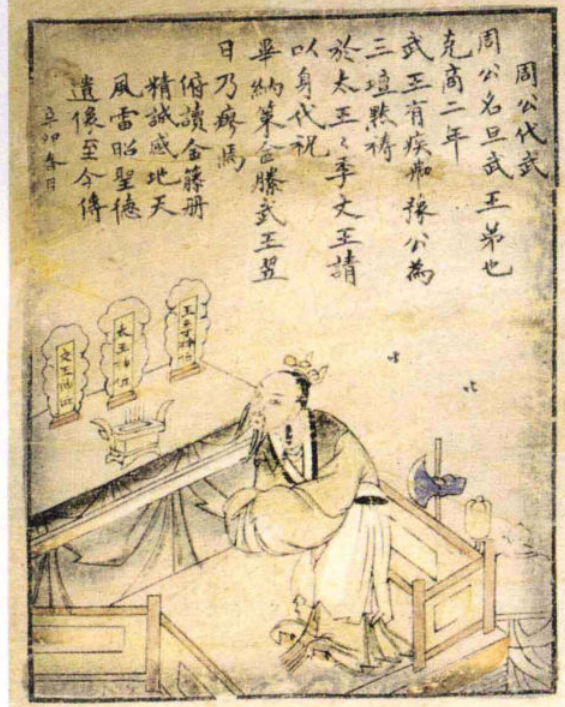
4-7 二十四梯图 106 × 26cm 清代 半印半绘 Illustrated Twenty-four cases of respect for one's elder brother 106 × 26 cm, Qing Dynasty, semi-printed and semi-drawn