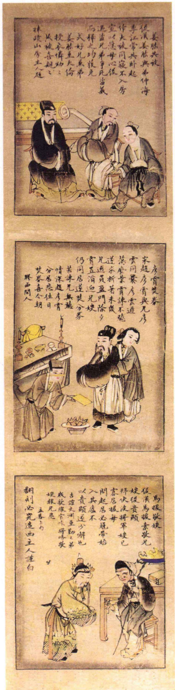
4-3 二十四梯图 106 × 26cm 清代 半印半绘 Illustrated Twenty-four cases of respect for one's elder brother 106 × 26 cm, Qing Dynasty, semi-printed and semi-drawn