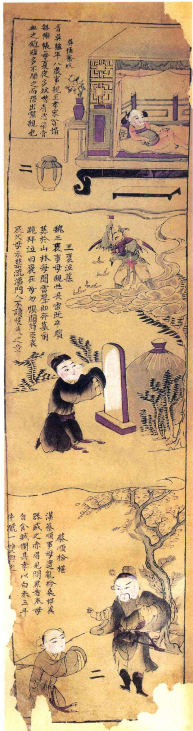
2-2 二十四孝图 103 × 30cm 清代 半印半绘 Illustrated Twenty-four Cases of Filial Piety 103 × 30 cm, Qing Dynasty, semi-printed and semi-drawn