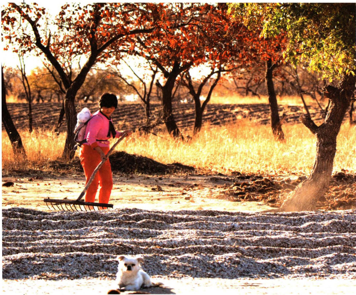
秋收忙

XII.The ink, painting, photography, paper cutting and other works in this book are provided by the Propaganda Department of Tongyu County, Tongyu County Tourism Bureau, and Bureau of Xianghai Nature Reserve of Jilin Province, ( Management Bureau of Xianghai for Short ) . And other proeses are cited from Xinhua Daily Telegraph, Jilin Daily, Baicheng Daily or by the author himself , they are signed by names, but we do not contact the authors, please forgive us.