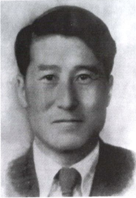
邓叔群教授 46 岁所摄 Prof. Shu Chun TENG(Dec. 12, 1902—May 10, 1970)