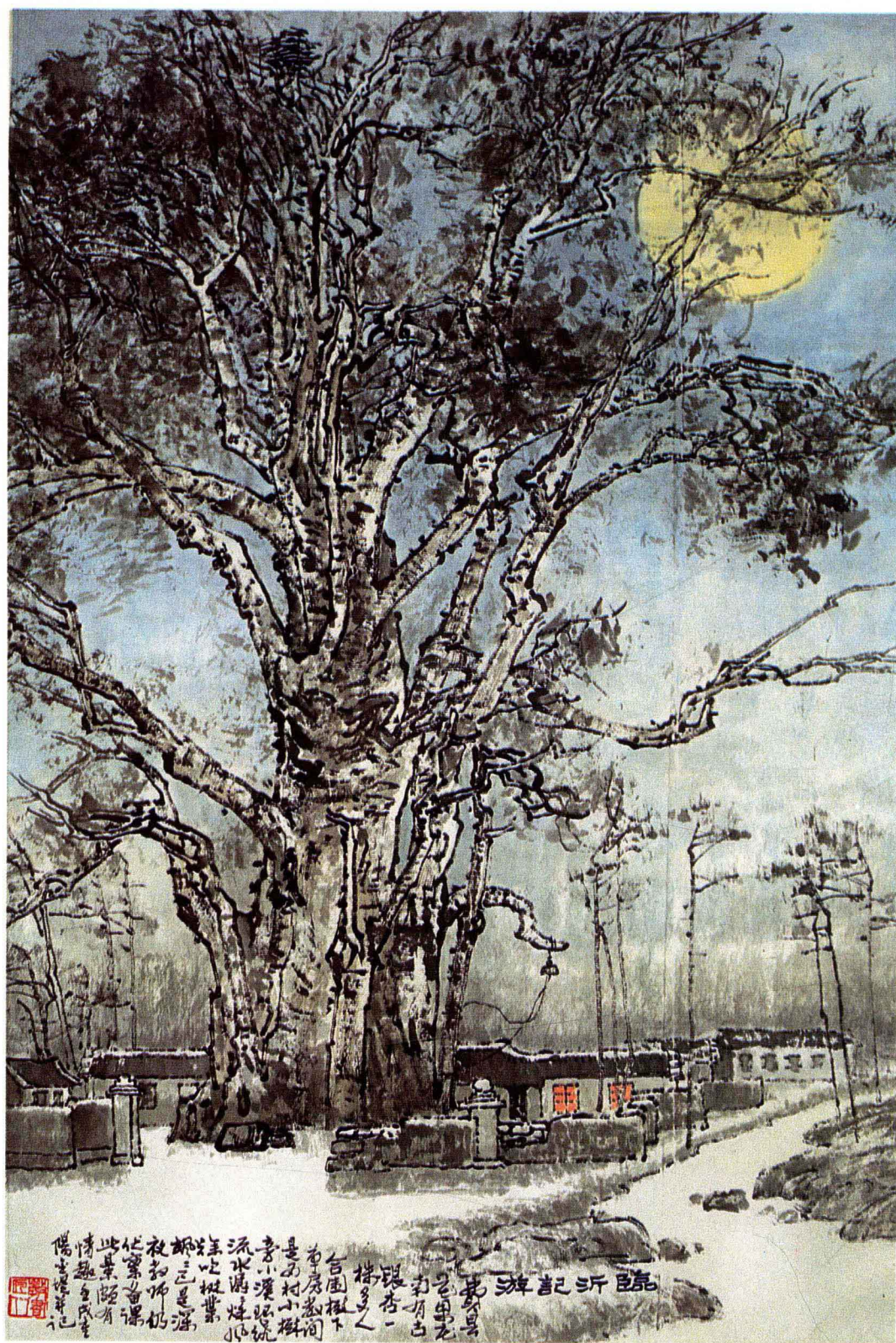
临沂记游(68×45cm) 1982 年