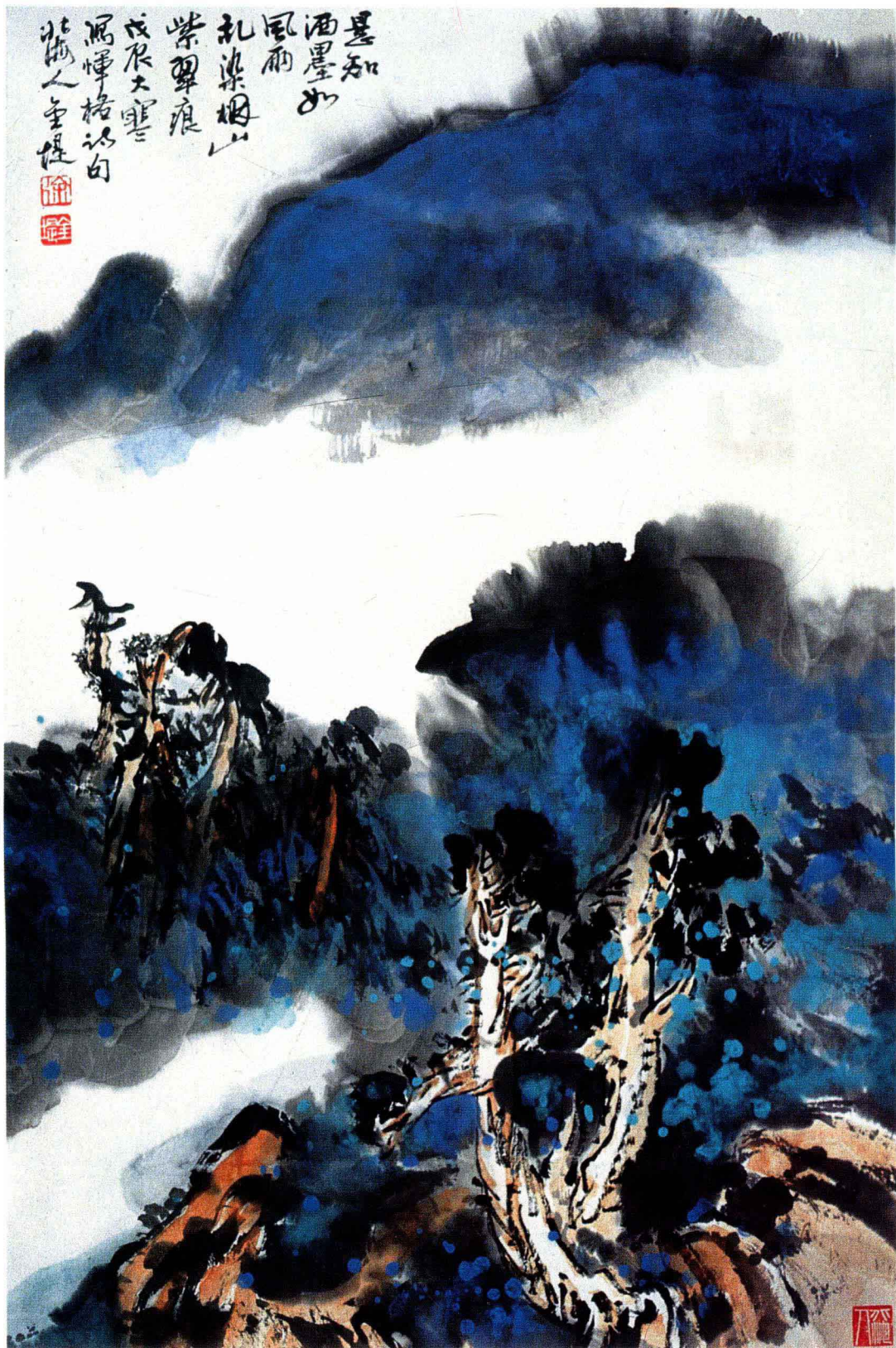
灑墨如風雨，烟山紫翠痕(68×45cm) 1988 年