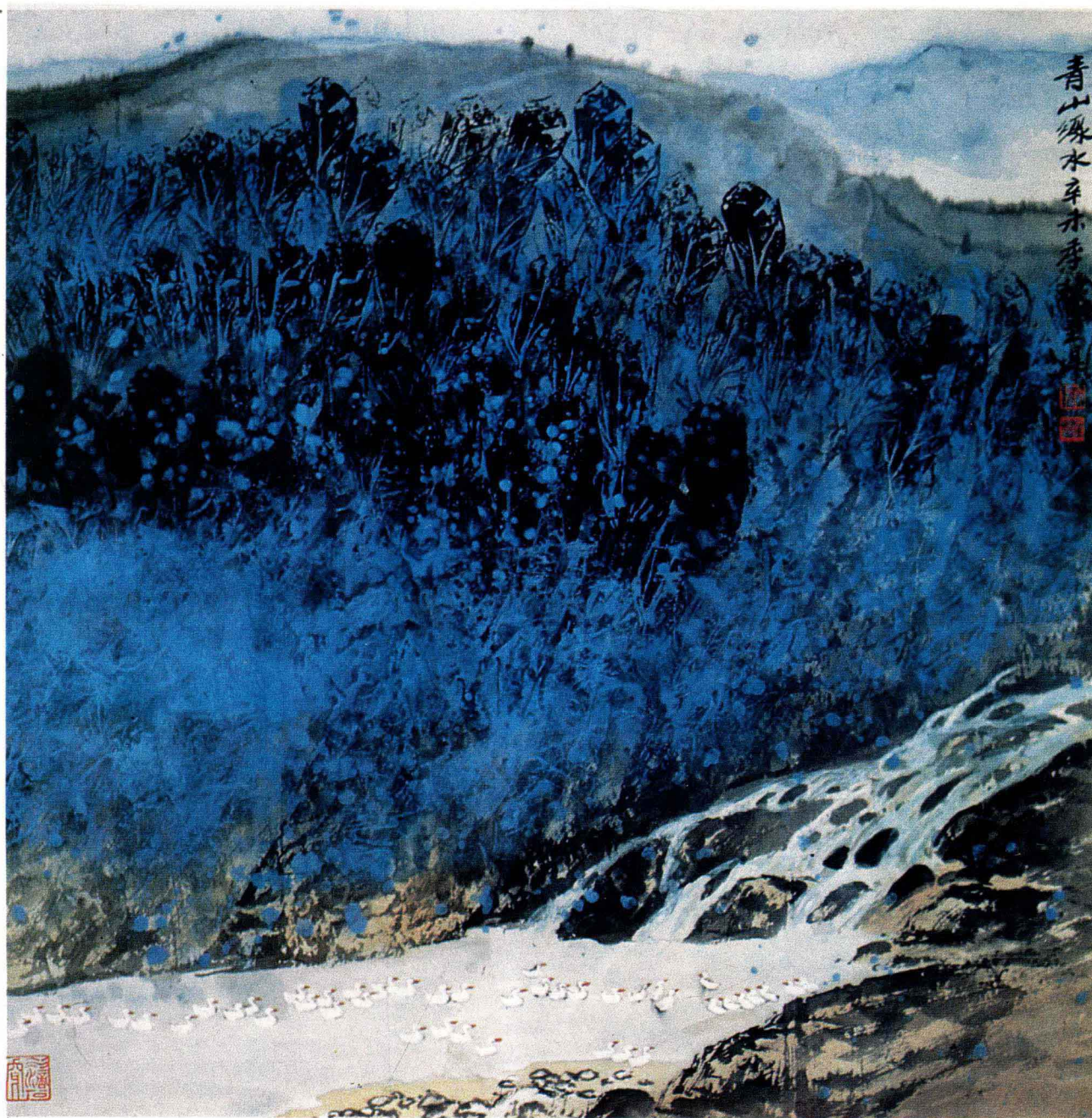
青山綠水(68×68cm) 1991 年 Green Hills and River