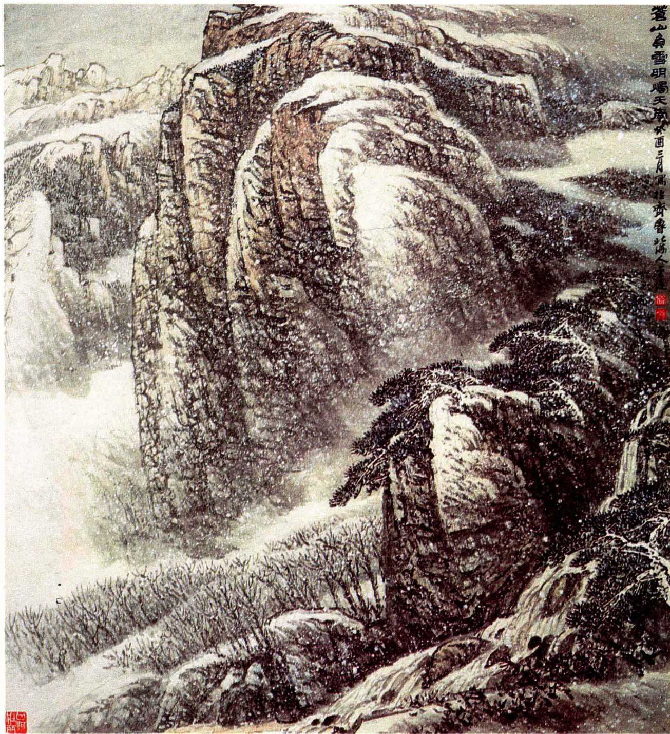
蒼山負雪明燭天南(112×97cm) 1993 年