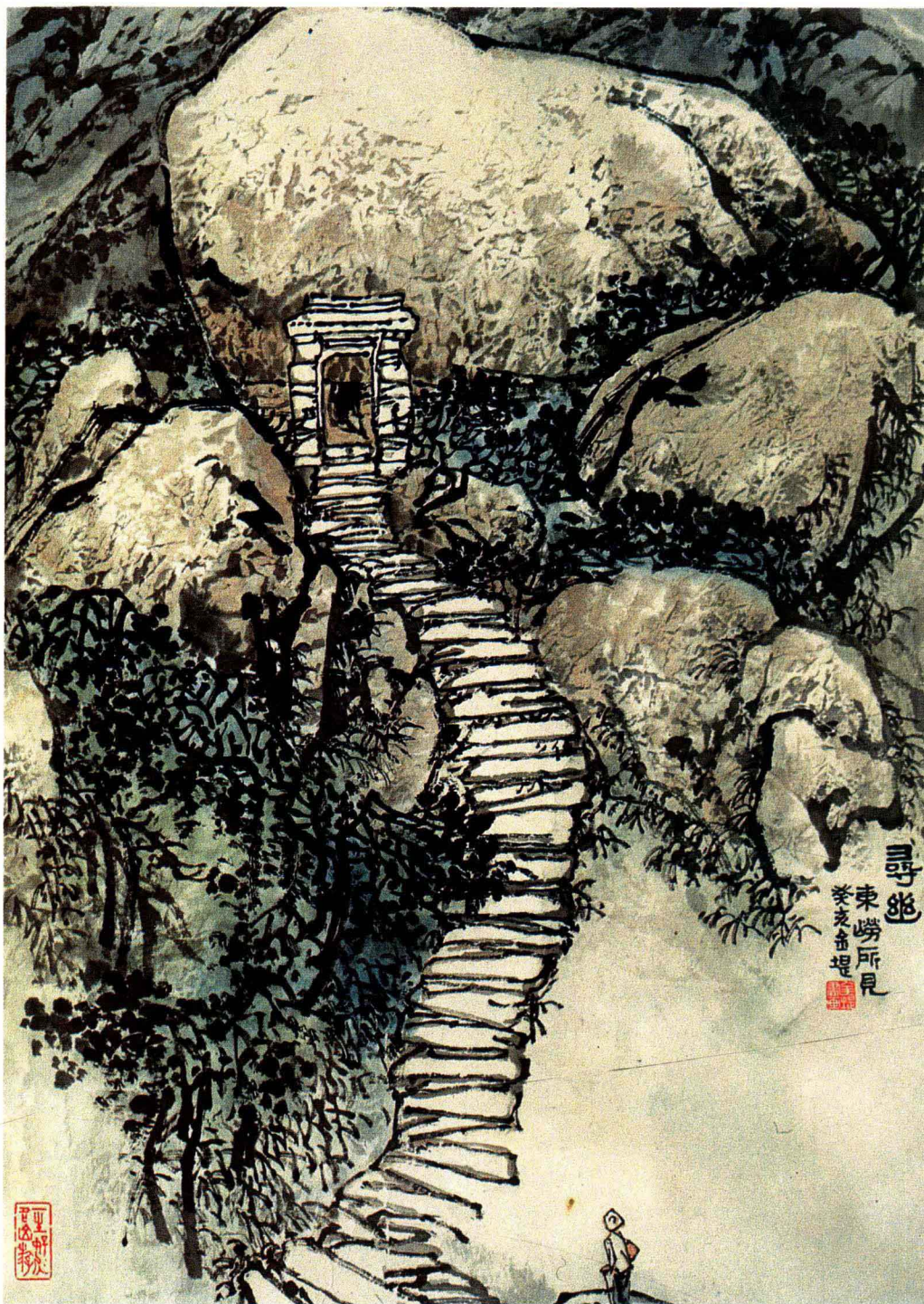
尋幽(68×45cm) 1983 年