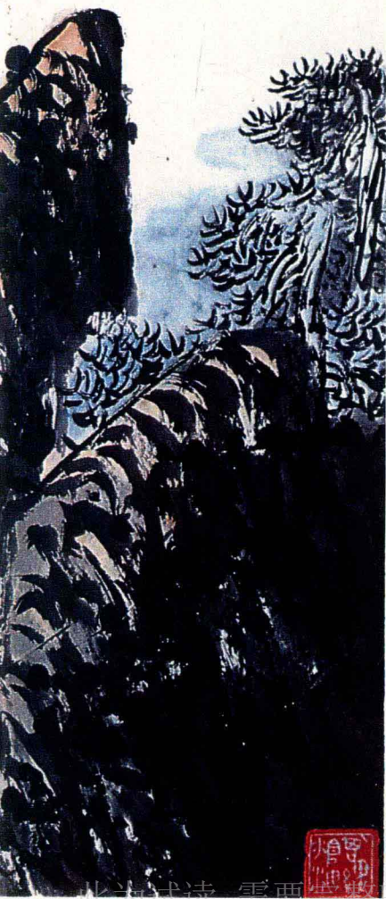
黃山天都峰禮贊(68×68cm) 1991 年 The Tiandu Peak of Huangshan