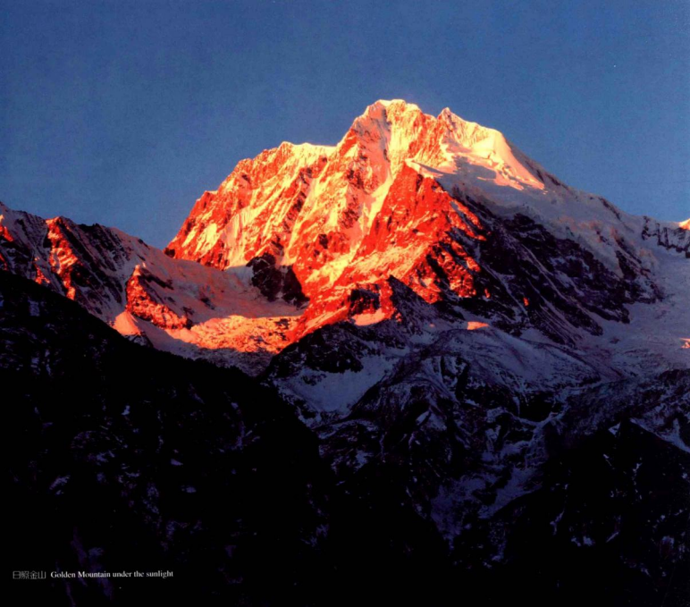
日照金山 Golden Mountain under the sunlight