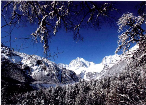
远眺神鹰峰 Sacred Eagle Peak in distance