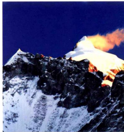
海螺峰 Conch Peak

扶摇三千丈，登高小天下。 挥手起风雷，长啸卷云霓。 猎猫晚风急，萧萧落木下。 日照千峰红，月映万花发。 愿醉此山中，天地寿无涯。