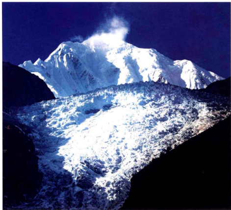
海螺沟一号冰川大冰瀑布 Huge ice waterfalls of No. 1 Glacier in Conch Gully