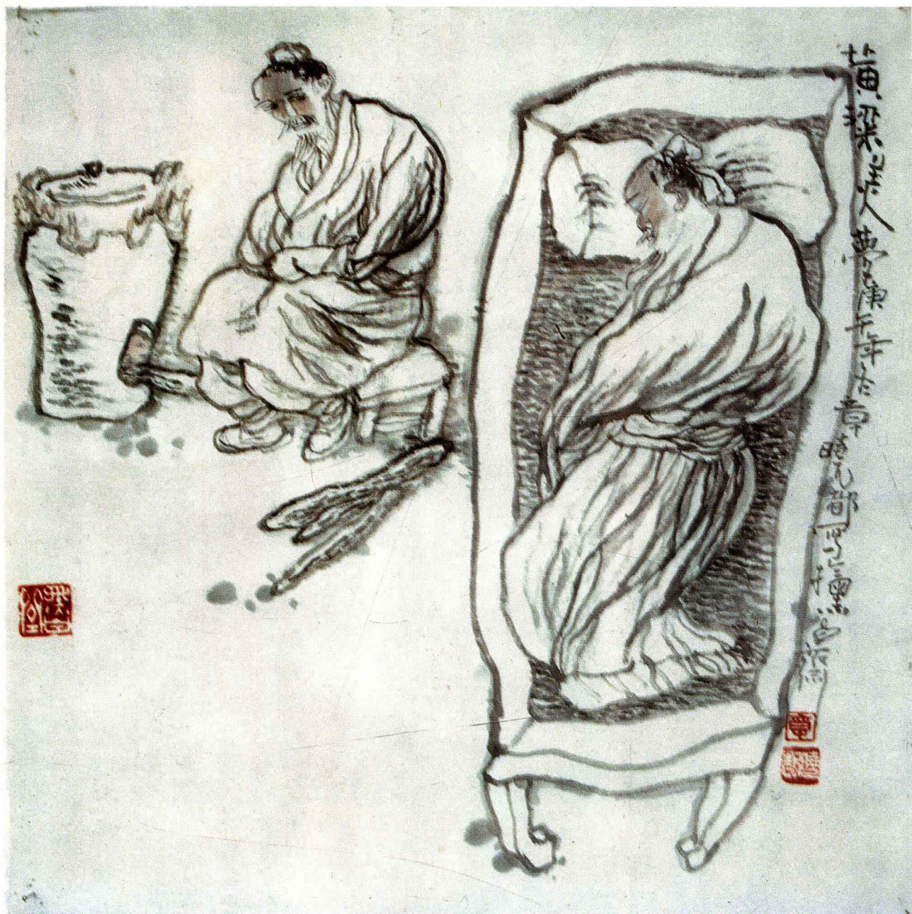
黃梁美夢 Pipe Dream