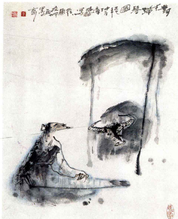
對牛彈琴 Choosing the Wrong Audience