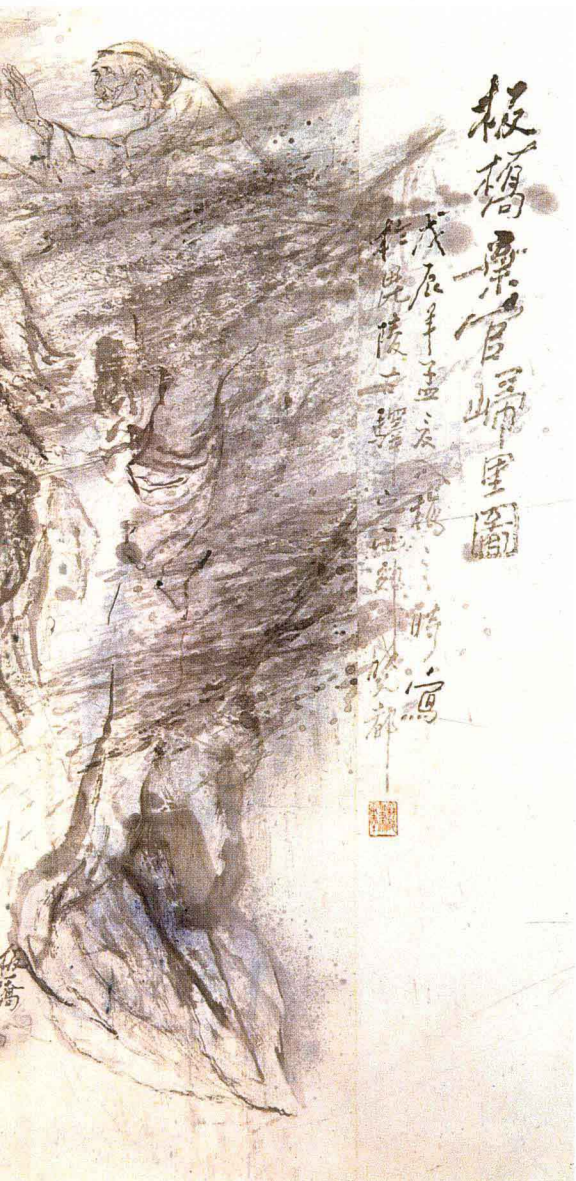
放鶴 Tending Cranes