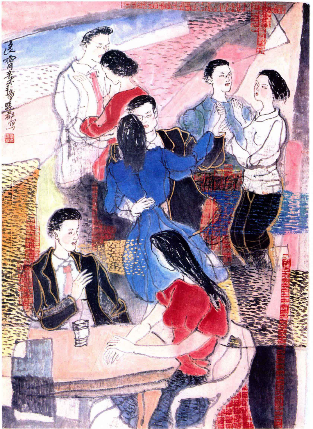
良 霄 At Night