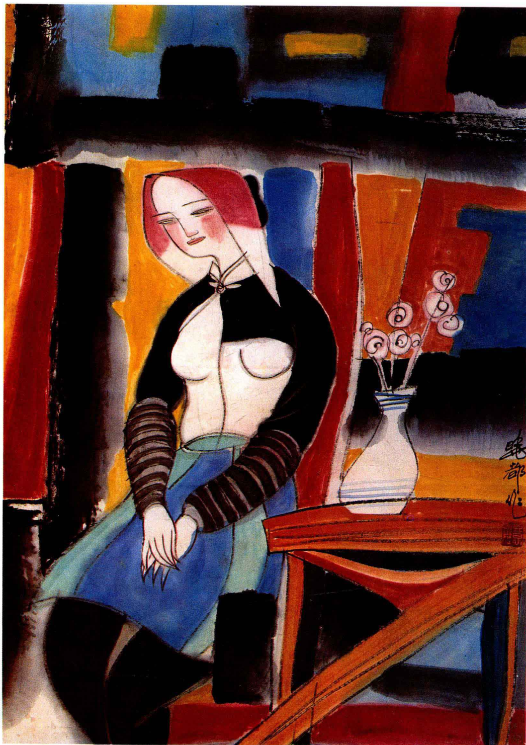
農家婦 Peasant Girl