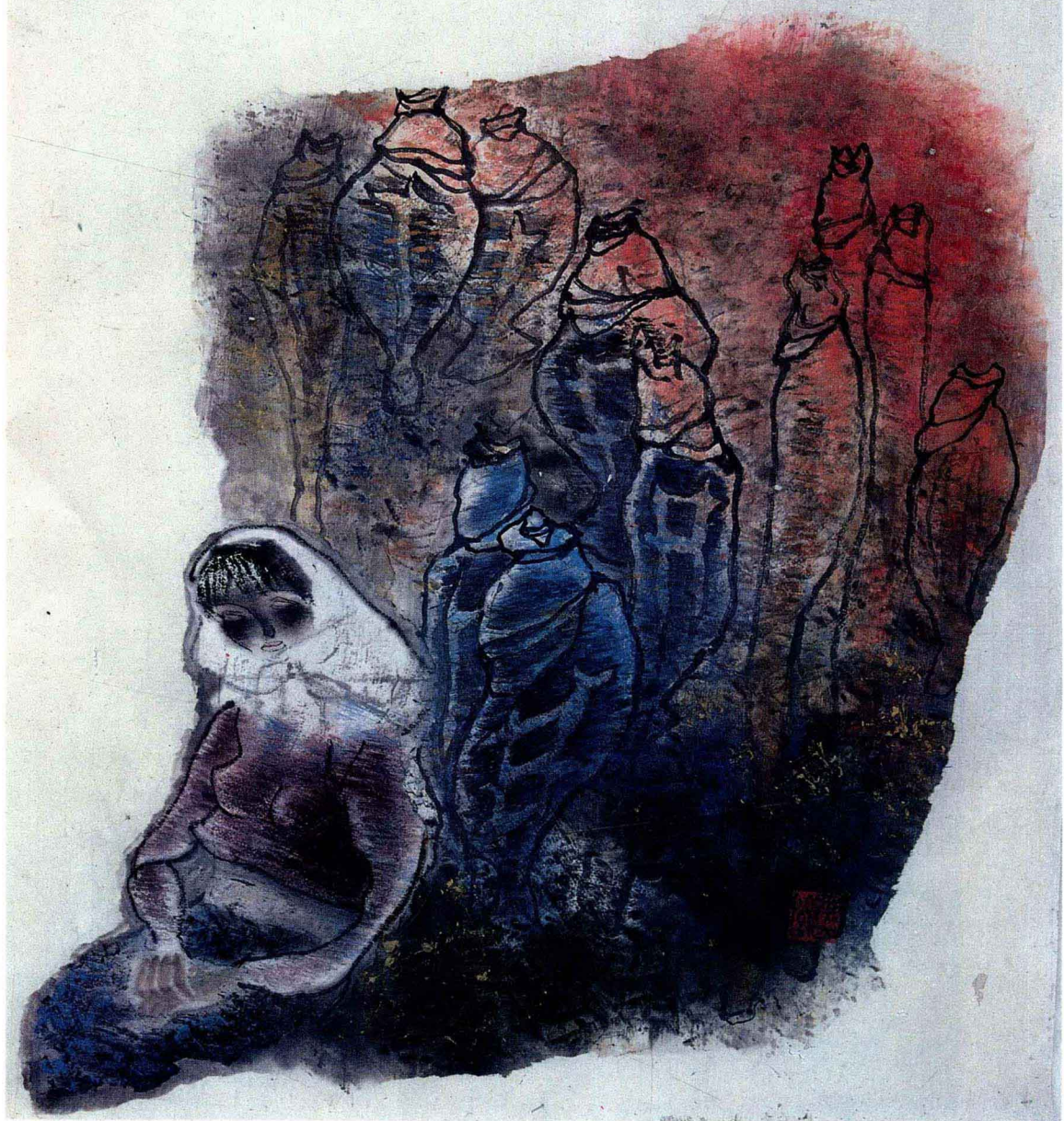
漁家女 Fisherman's Daughter