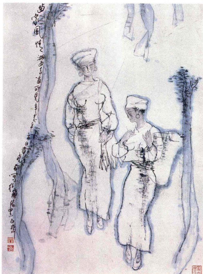
苗家風情 The Miao Nationality