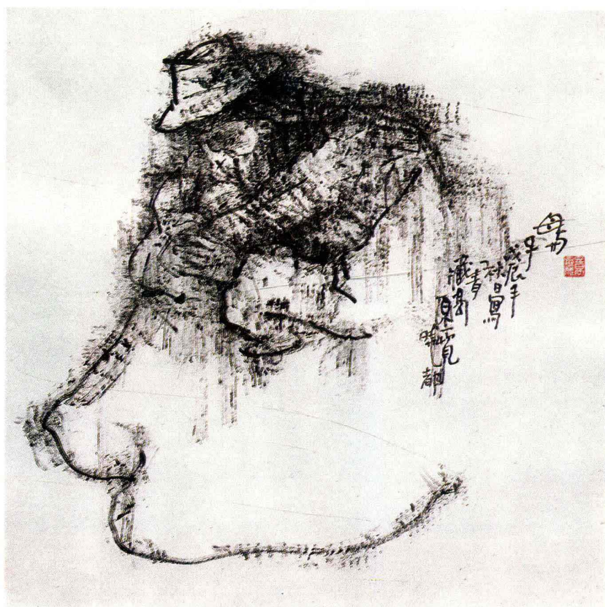
母與子 Mother and Son