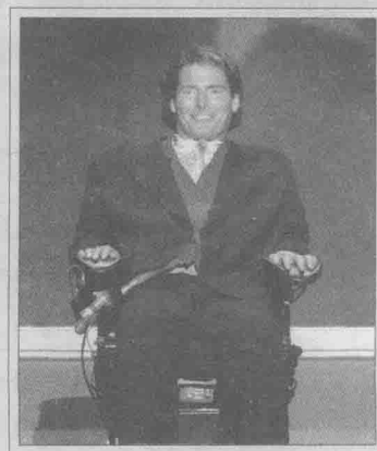
Christopher Reeve September 25, 1952–October 10, 2004

Amazingly, he continued to act in movies and direct them. But most importantly, he became an activist for people with spinal cord injuries. He raised money for research and started