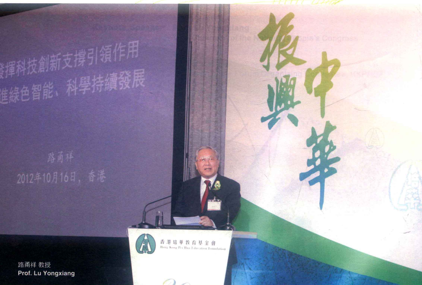
路甬祥 教授 Prof. Lu Yongxiang

The 3rd Forum on Future Development of China