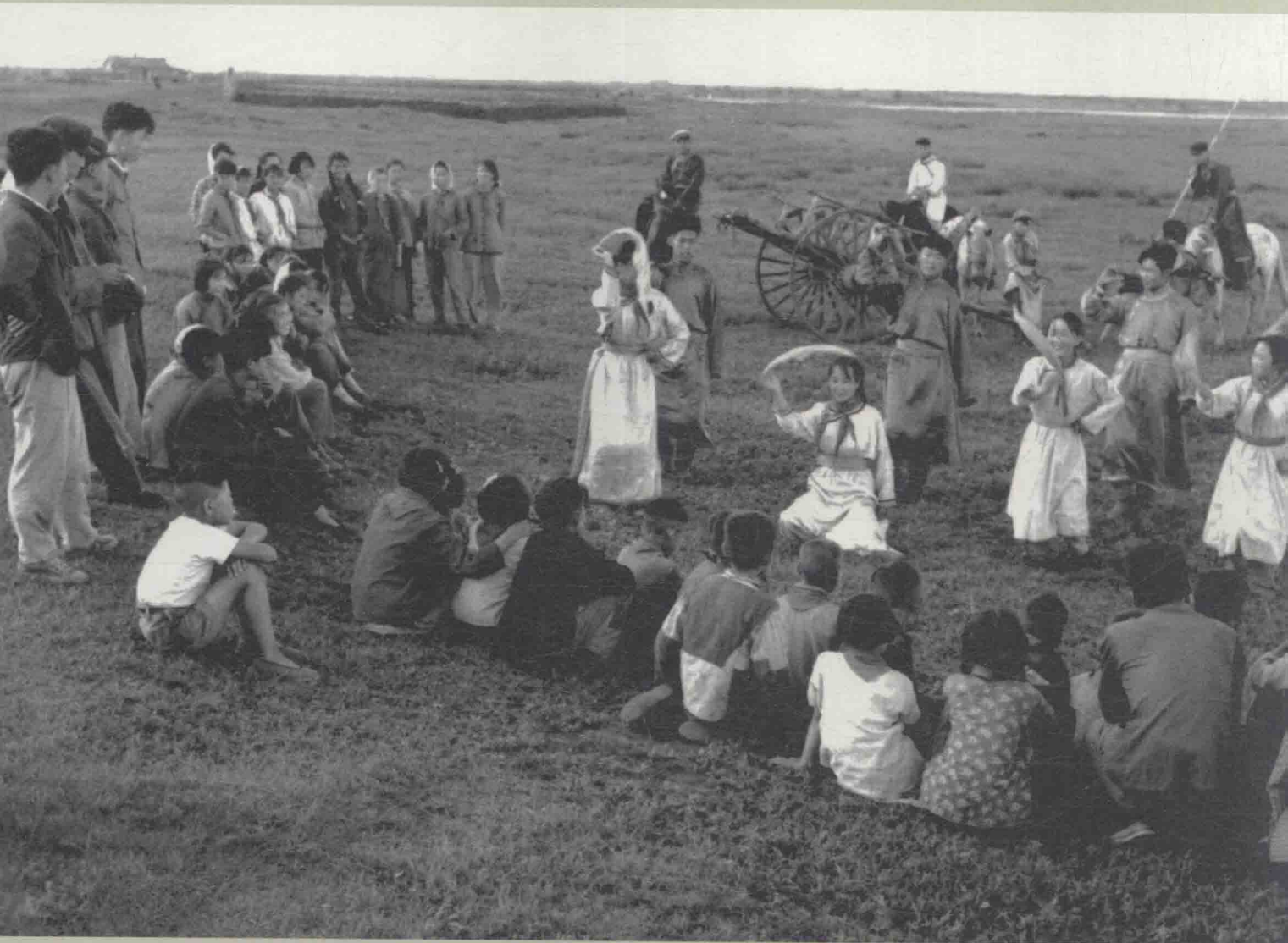
© Mongolian girls are dancing on the grassland, 1962. Photo by Wang De