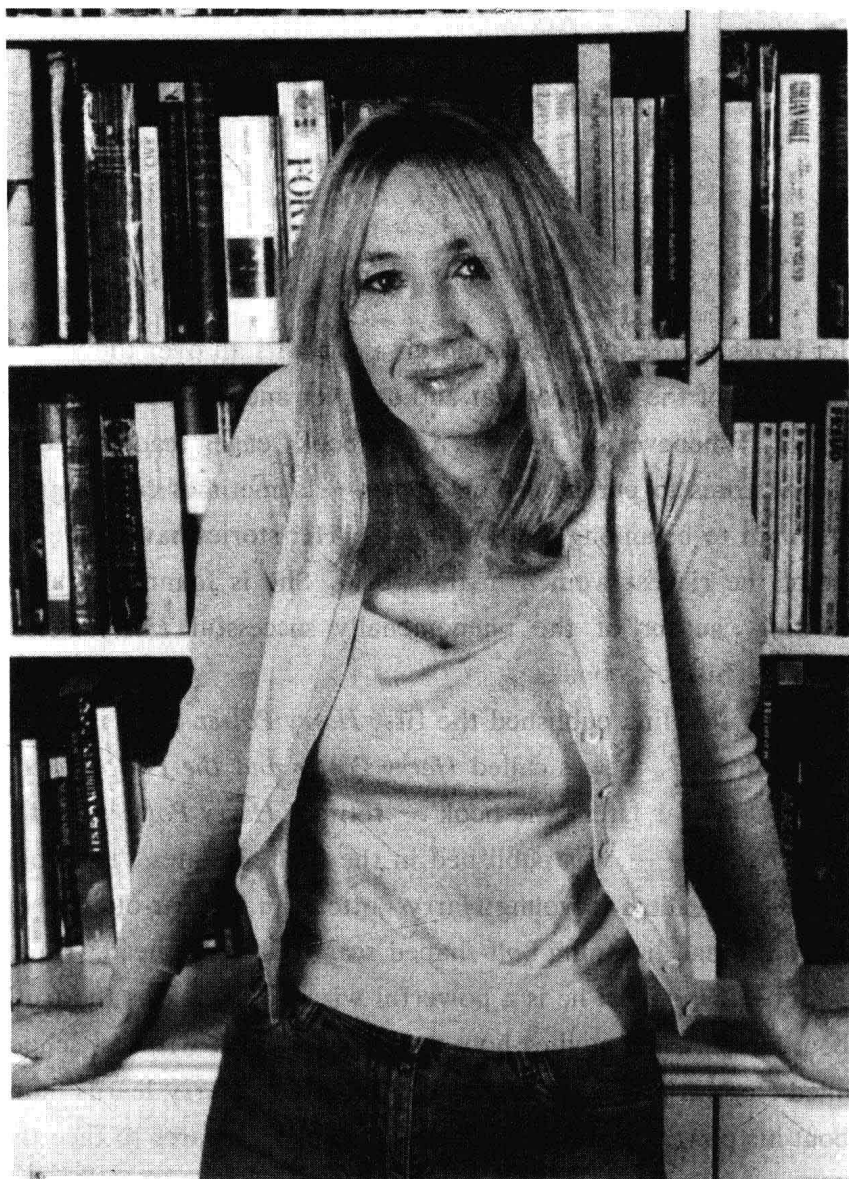
Joanne Kathleen (J. K.) Rowling's books have captivated children and adults all over the world.

乔安妮·凯瑟琳·(J.K.)罗琳的作品让全世界的孩子和大人们着迷。(兰道夫提供)