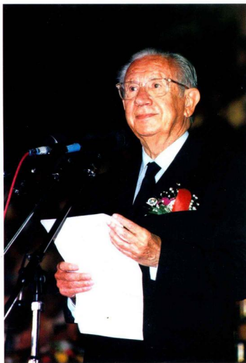
国际奥委会主席萨马兰奇在大连国际服装节开幕式上致辞 Mr.Samaranch, Chairman of the International Olympic Committee, speaking at the Opening Ceremony