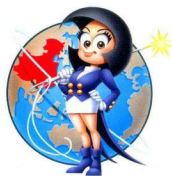
吉祥物（滨滨） Mascot (Bin Bin)