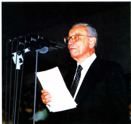
联合国前秘书长加利博士在大连国际服装节开幕式上致辞 Dr.Ghali, former Secretary General of the United Nations, addressing the Opening Ceremony