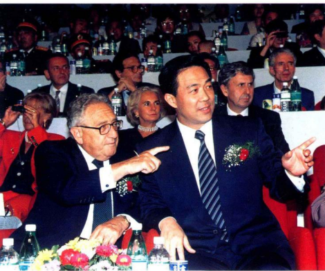
美国前国务卿基辛格博士出席大连国际服装节开幕式暨大型广场艺术晚会 Dr. Henry Kissinger, former US Secretary of State, at the Opening Ceremony and Evening Gala