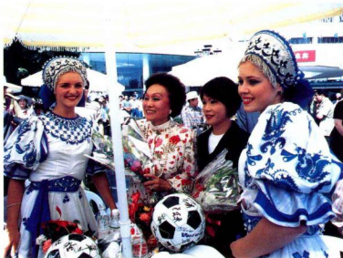
著名美籍华人、社会活动家陈香梅女士参加大连国际服装节巡游表演活动 Chen Xiangmei, noted American Chinese and social activist, attending the motorized demonstration of fashions