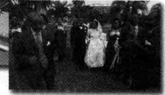
Getting married in Ethiopia. In many cultures, getting married is a sign of adulthood.