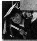
High school graduation is a big event for many Americans.