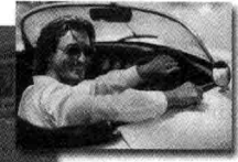
People can drive at age 16 in New Zealand.