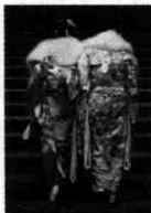
Twenty-year-olds dressed in elegant Kimonos with white fur collars on Coming-of-Age Day

In Japan, 20-year-olds have the legal rights of adults. For example, they can vote and get married without parental consent. To celebrate this, many young people participate in Coming-of-Age Day ( Seijin no Hi ). Coming-of-Age Day is the second Monday in January. It is a national holiday—a holiday for everyone in the country. Even in ancient Japan, there were coming-of-age ceremonies. The modern ceremony, however, began in 1876. In that year, 20 became the legal age of adulthood.