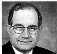
Prof. Neal Lane