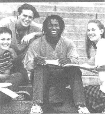
Reading to Develop Your Ideas