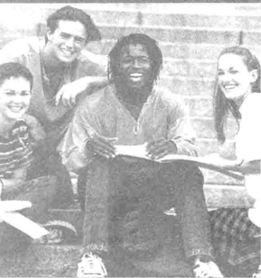
Reading to Develop Your Ideas