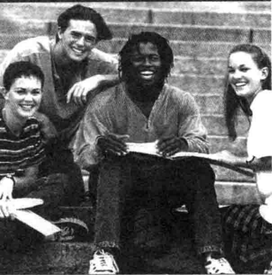
Reading to Develop Your Ideas