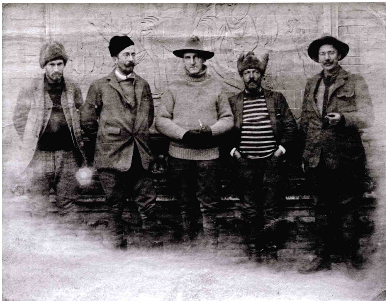
Members of the expedition, from left to right: