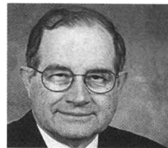
Prof. Neal Lane