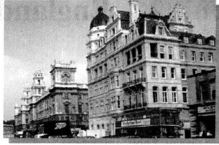
Modern flats in London