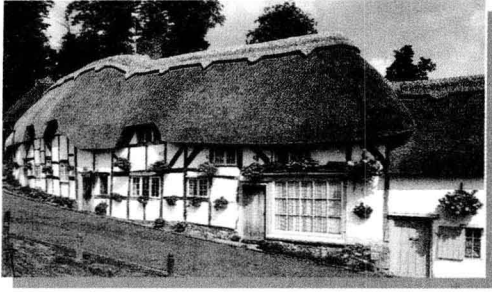
Old English cottages