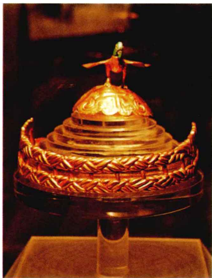
• 匈奴鹰形金冠（战国） An Eagle-shaped Gold Crown (Warring States Period, 475 B.C.-221 B.C.)