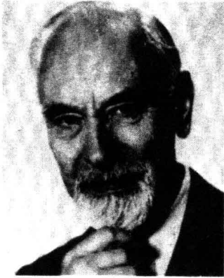
Ludwig Prandtl (1875-1953)