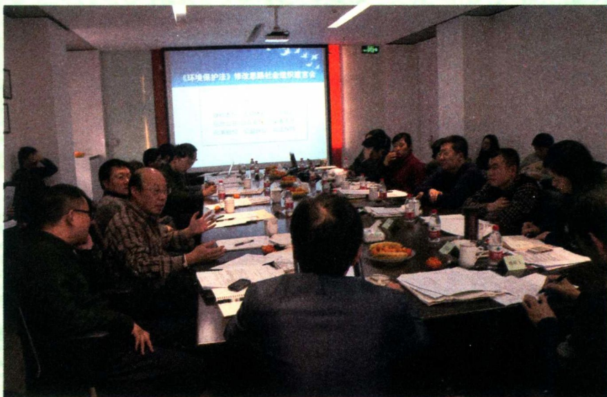
2013 年 1 月 15 日《环境保护法》修改思路社会组织建言会开会场景