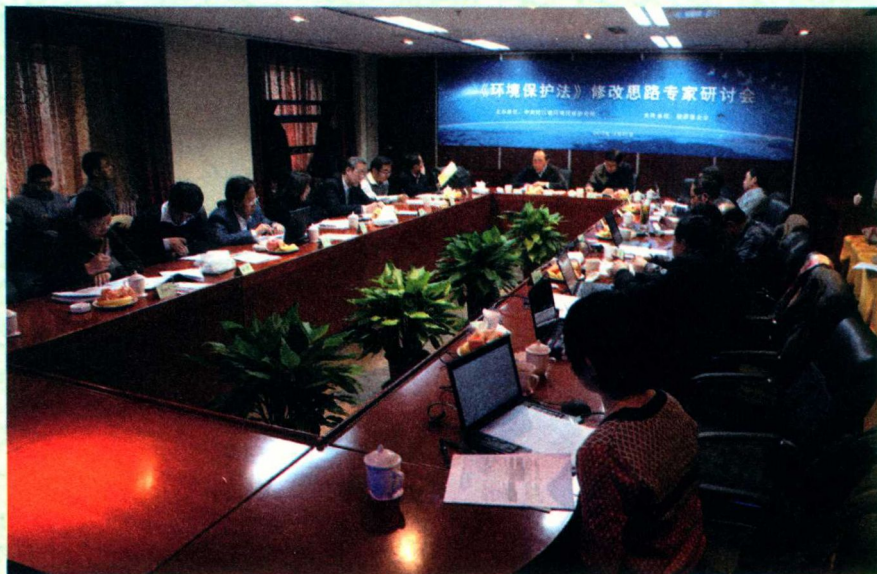
2012 年 12 月 20 日《环境保护法》修改思路专家研讨会开会场景