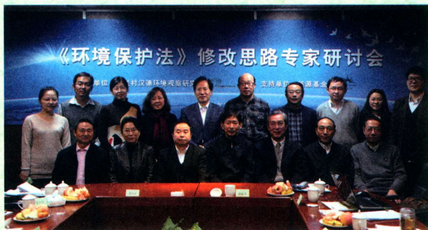
2012 年 12 月 20 日《环境保护法》修改思路专家研讨会合影