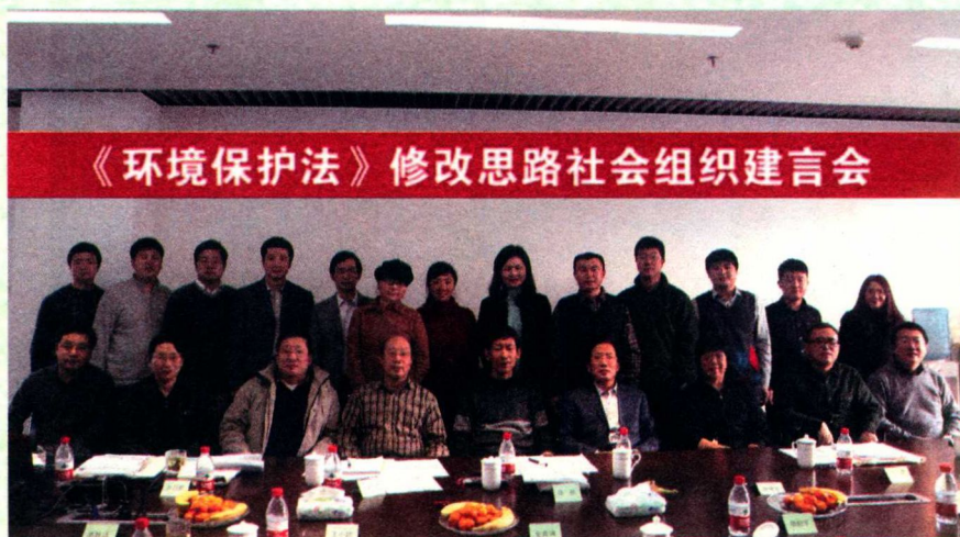
A Group Photo of the Social Organization Meeting on Thoughts of Revision of the Environmental Protection law on January 15 th , 2012