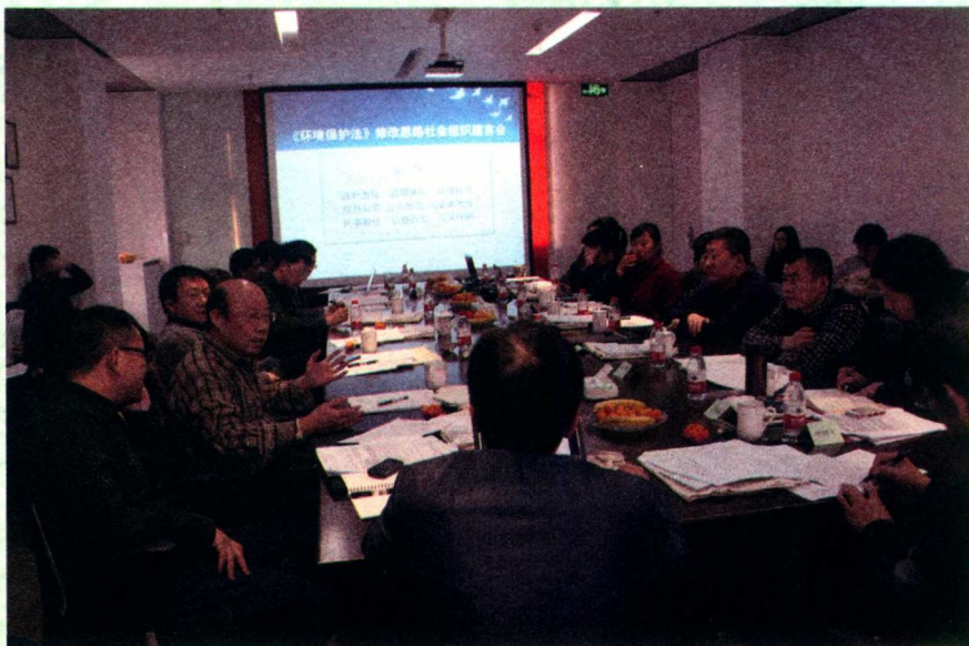
The Social Organization Meeting on Thoughts of Revision of the Environmental Protection Law on January 15 th , 2012