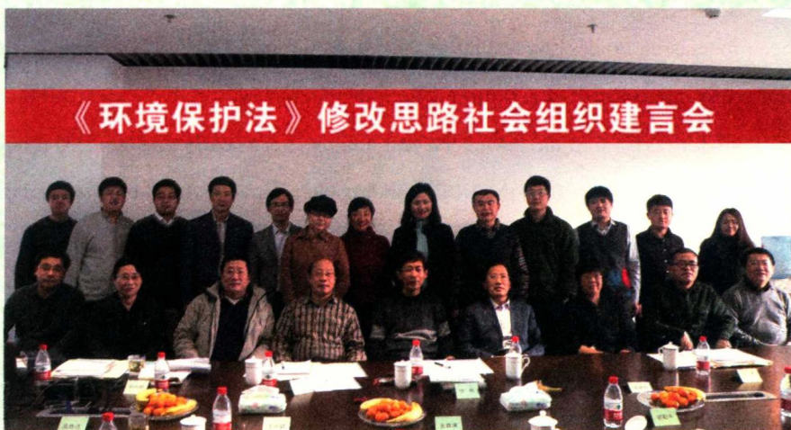
2013 年 1 月 15 日《环境保护法》修改思路社会组织建言会合影