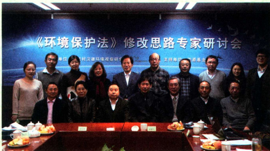
A Group Photo of Experts Attending the Seminar on Thoughts of Revision of the Environmental Protection Law on December 20 th , 2012