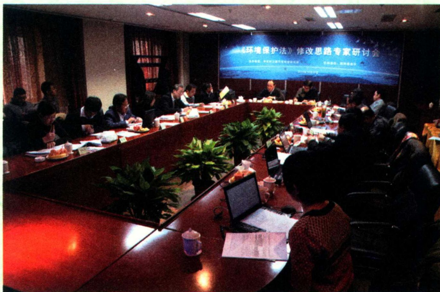
Seminar on Thoughts of Revision of the Environmental Protection Law on December 20 th , 2012.