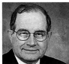
Prof. Neal Lane