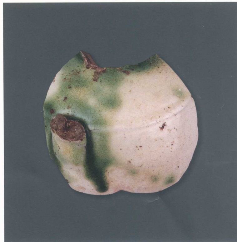
348 宋 白釉绿彩壶标本 Song dynasty Specimen of white glaze pot with green color design