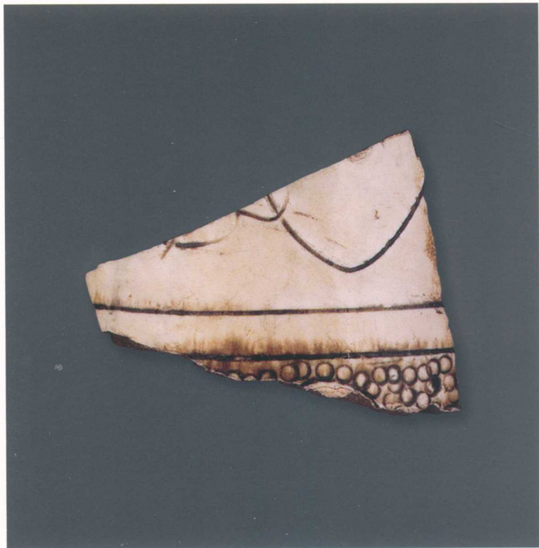
347 宋 珍珠地划花瓶标本 Song dynasty Specimen of vase with incised design over pearl-pattern ground