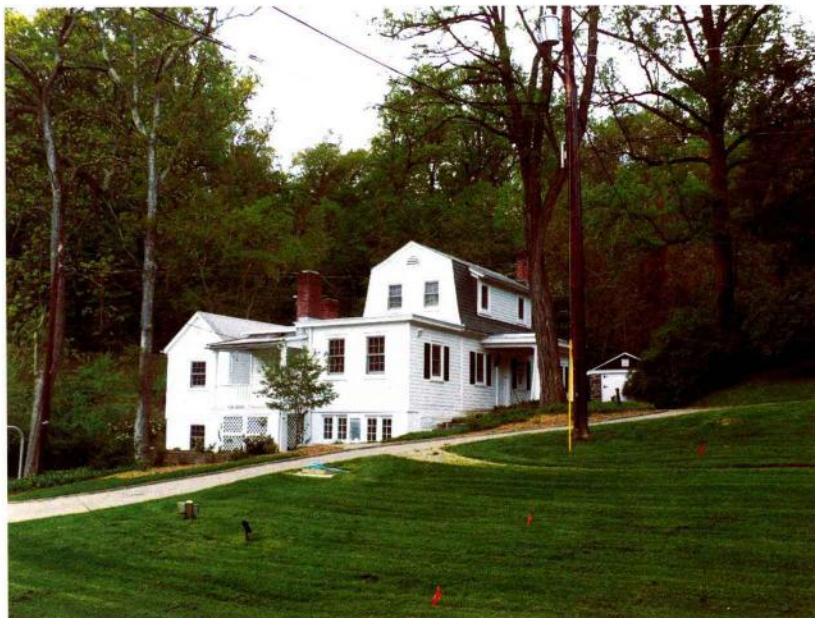
见到中国驻美大使馆教育处办公楼，有一种“回家”的感觉 Sight of the Education Department office building of Chinese Embassy makes me feel at home