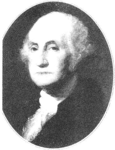
1 st President · 1789 – 1797

A mong the vicissitudes incident to life, no event could have filled me with greater anxieties than that of which the notification was transmitted by your order and received on the fourteenth day of the present month. On the one hand, I was summoned by my country, whose voice I can never hear but with veneration and love, from a retreat which I had chosen with the fondest predilection, and, in my flattering hopes, with an immutable decision, as the asylum of my declining years—a retreat which was rendered every day more necessary as well as more dear to me by the addition of habit to inclination, and of frequent interruptions in my health to the gradual waste committed on it by time. On the other hand, the magnitude and difficulty of the trust to which the voice of my country called me, being sufficient to awaken in the wisest and most experienced of her citizens a distrustful scrutiny into his qualifications, could not but overwhelm with despondence one who (inheriting inferior endowments from nature and unpracticed in the duties of civil administration) ought to be peculiarly conscious of his own deficiencies. In this conflict of emotions, all I