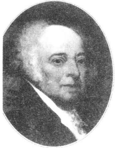
2 nd President · 1797 – 1801

The zeal and ardor of the people during the Revolutionary war, supplying the place of government, commanded a degree of order sufficient at least for the temporary preservation of society. The Confederation which was early felt to be necessary was prepared from the models of the Batavian and Helvetic