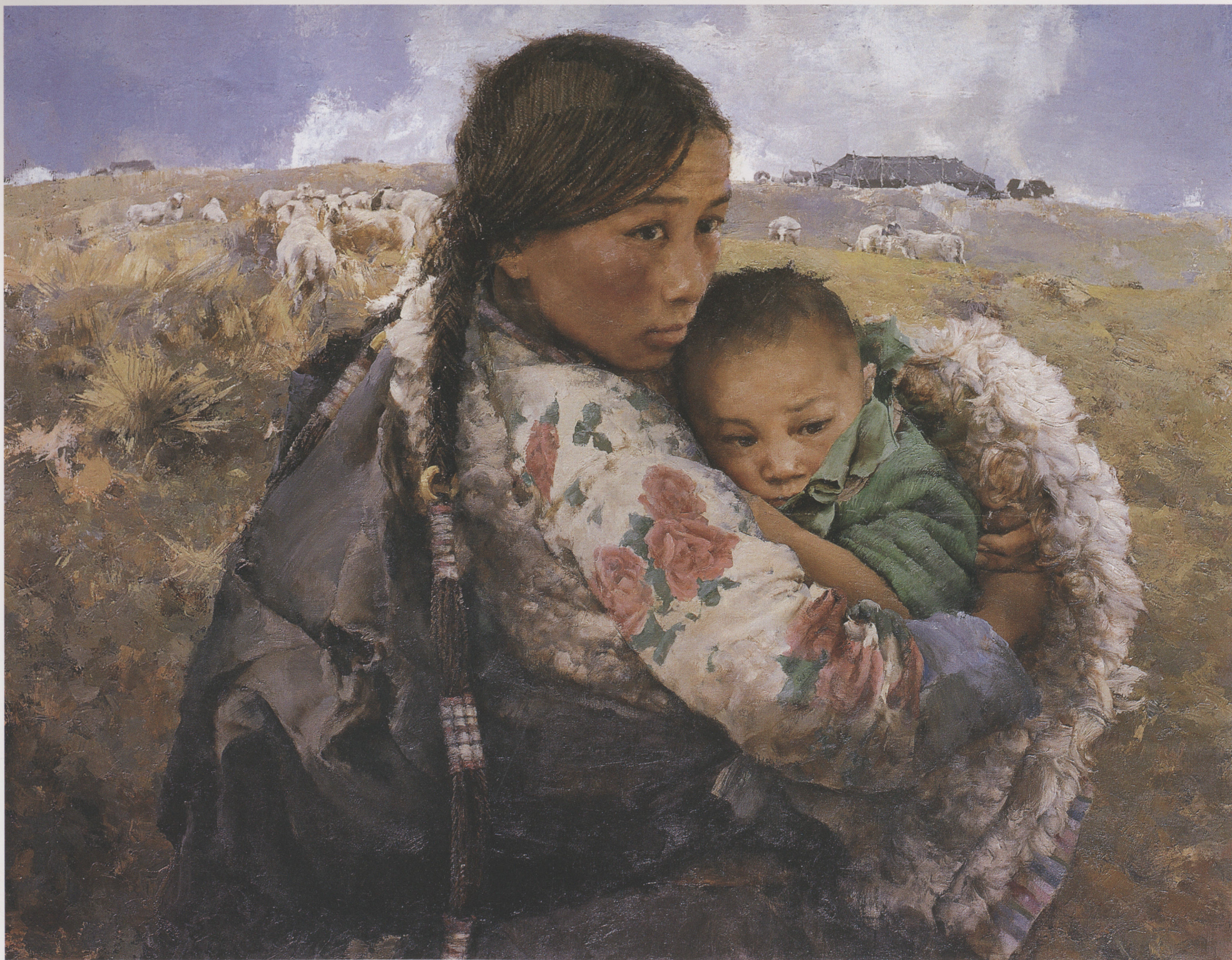
母子情深 Mother and Son