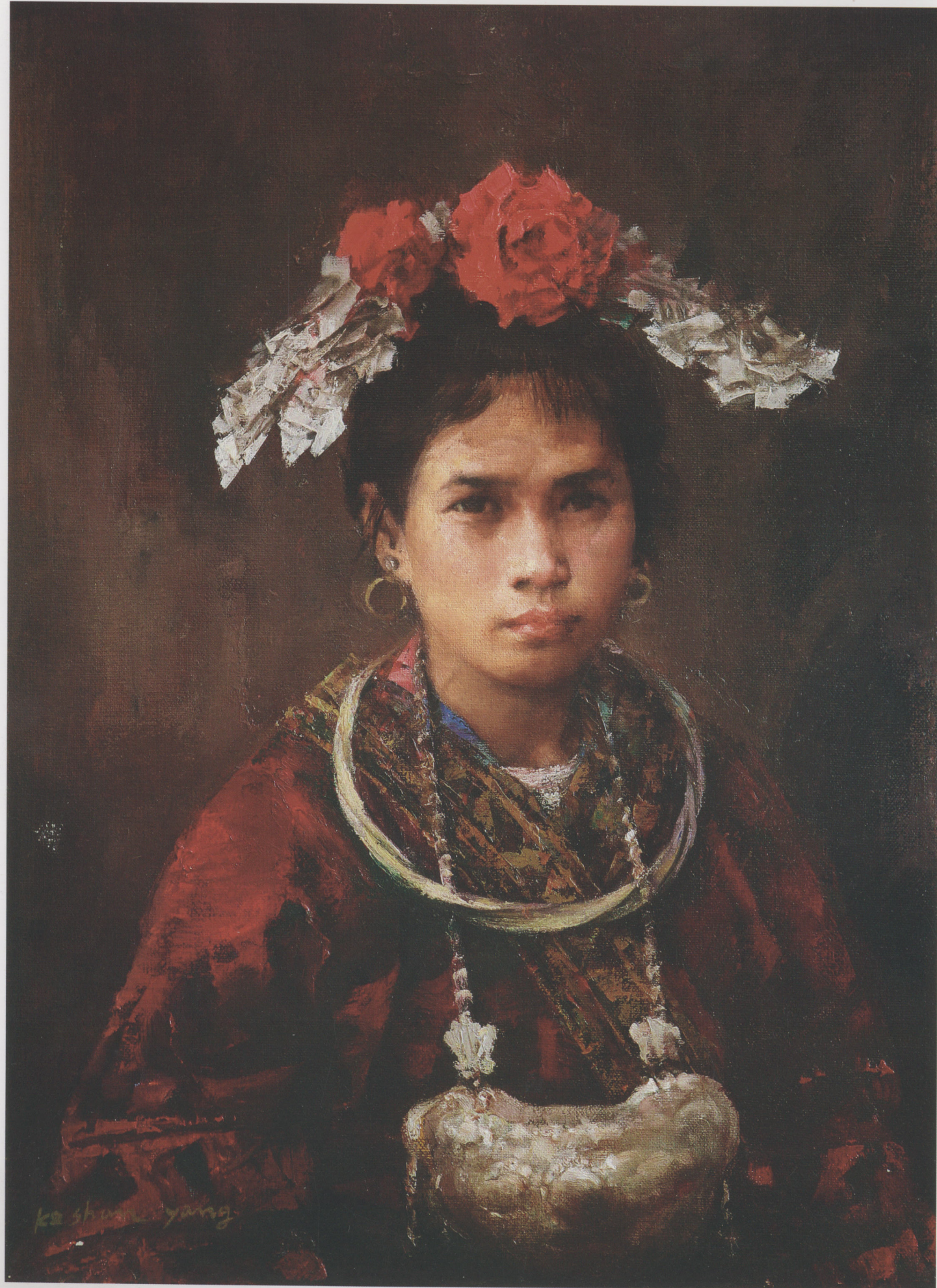
苗女 Girl of Miao Minority