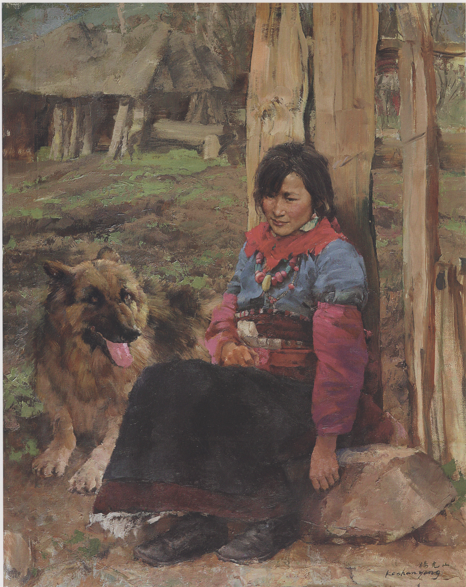
扎西姑娘 Girl of Zhaxi