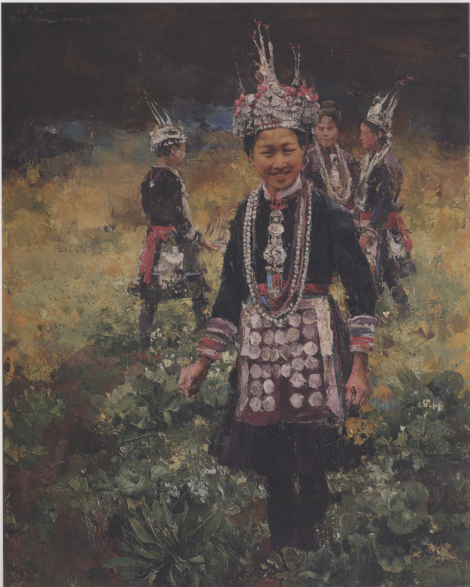
油菜花 Rape Flower