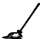
a mop [ə 'mɒp]