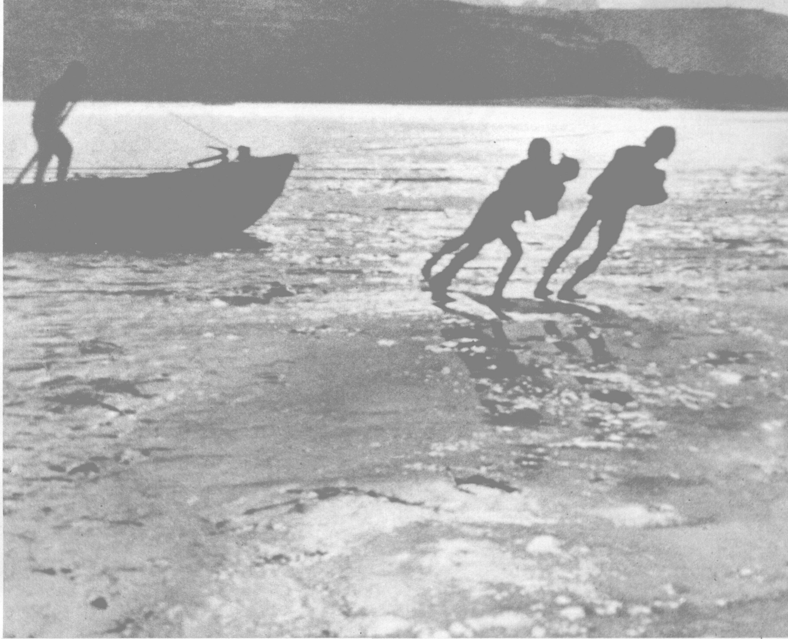
4 纤夫 1930 江苏 Boat trackers. 1930, Jiangsu