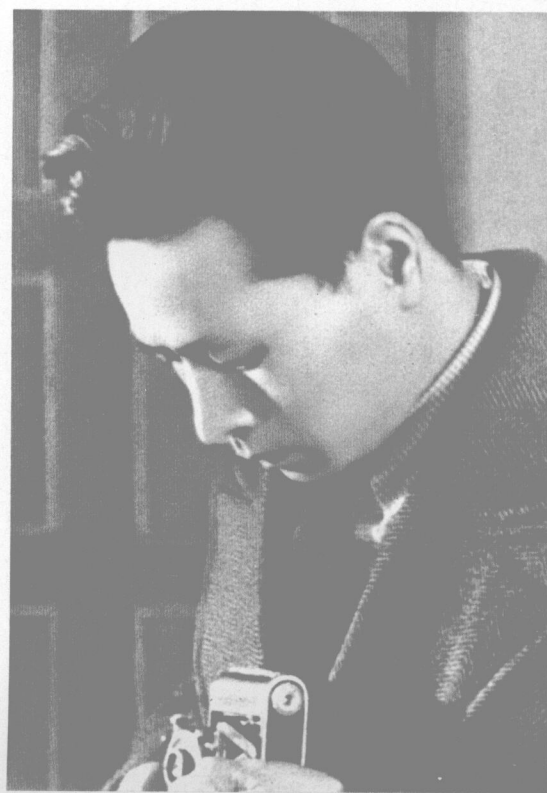
作者像 1930 上 海