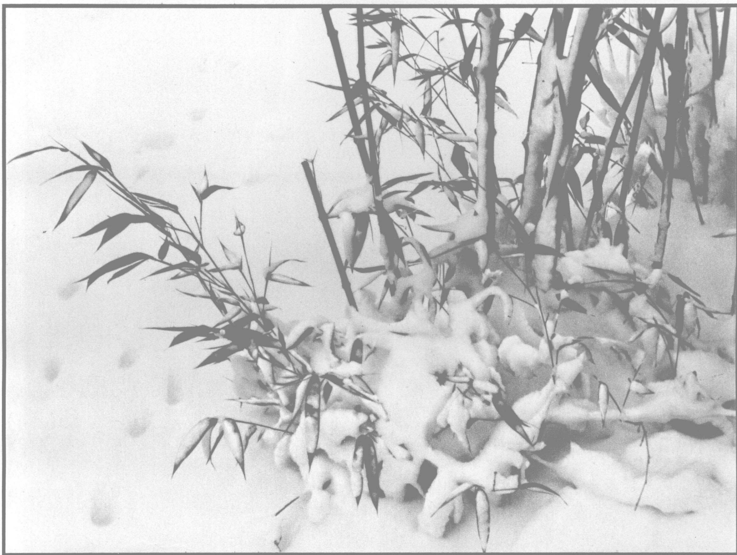
2 雪 竹 1924 江 苏