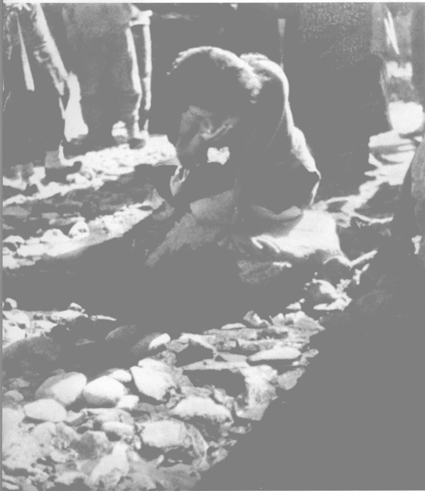
3 饥寒交迫 1924 江 苏

Suffering hunger and cold. 1924, Jiangsu