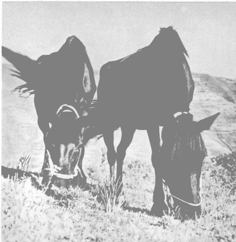
5 觅食 1924 江苏 Country bridge. 1926, Jiangsu