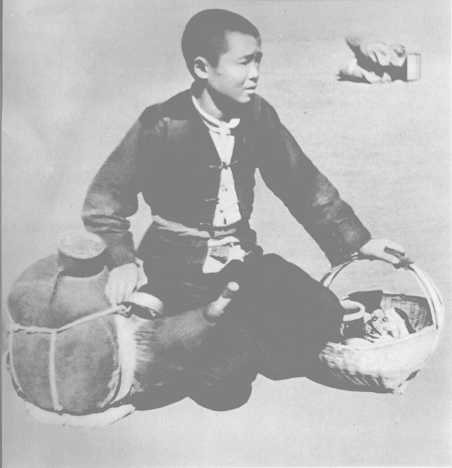
7 油茶小販 1936 山 西 Pedlar. 1936, Shanxi