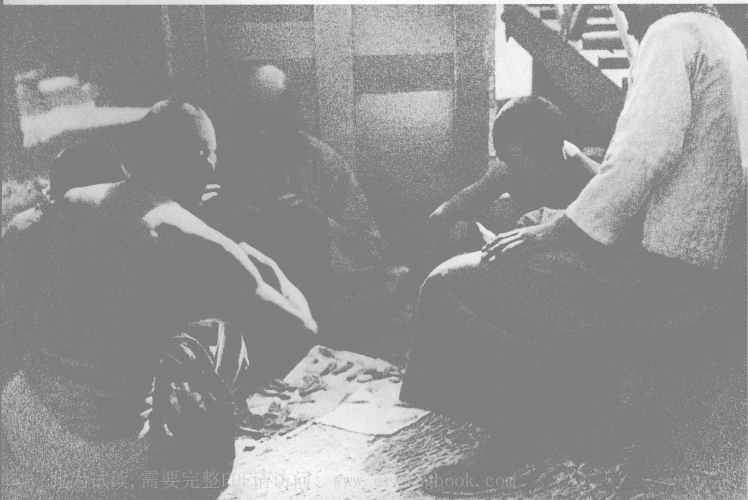
8 賭 1926 上 海 Gambling. 1926, Shanghai