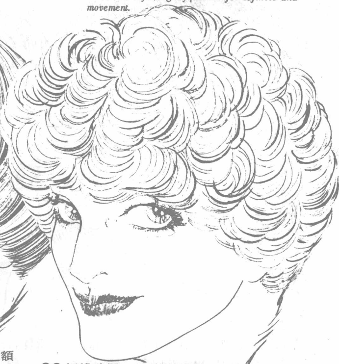
36 短緣邊層，電作整體鬆曲，用粗卷筒作半髻環，自然風乾。雍容艷發，豐姿而有貴氣。 Layered hair given gentle perm and left to dry naturally.