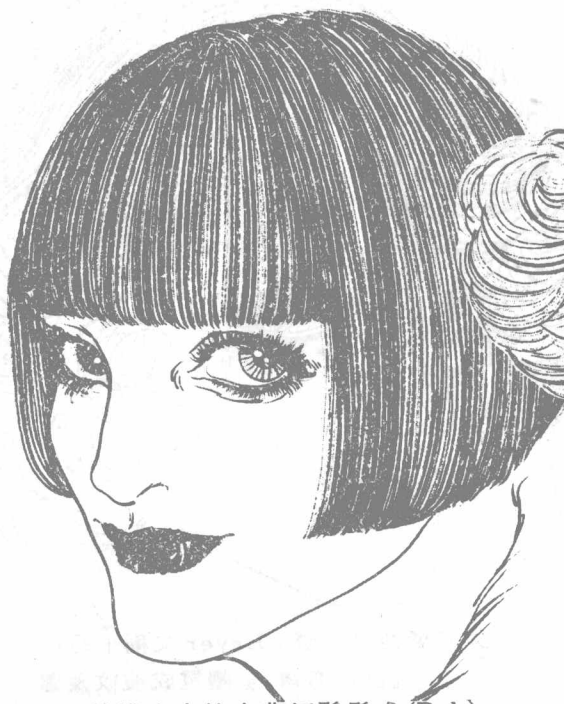
1 簡樸大方的古典短簪髻式 (Bob), 適合各種時代, 容易梳理。 Sleek classic short bob. Keeping popular, through all ages.