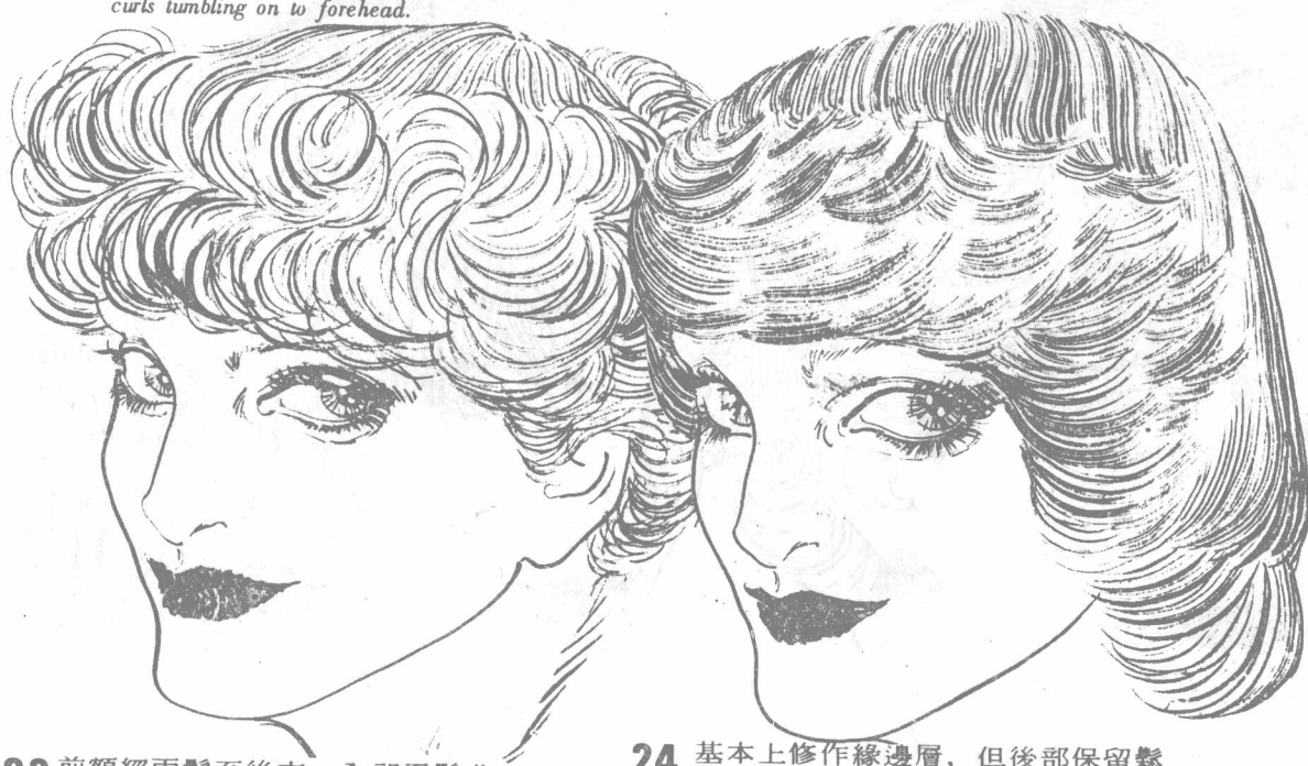
23 前額經兩鬢至後方，全部電髻曲，但頭頂部分，則作平順的姿態。 Pretty curls for soft halo, crown is keep smooth.