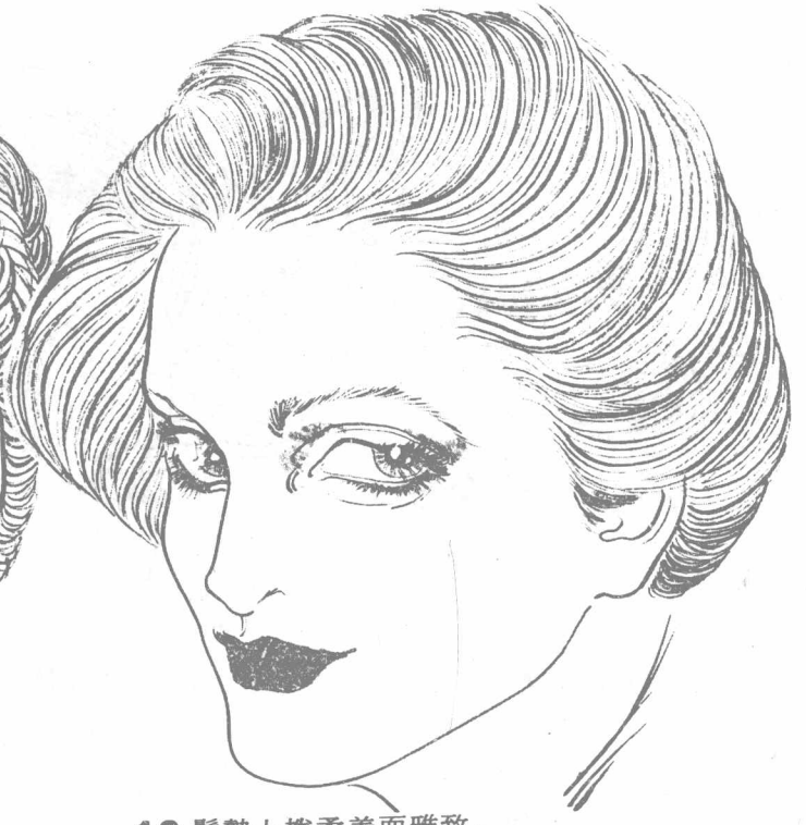
18 髮勢上捲柔美而雅致。 Elegant off-the-face style for evening.