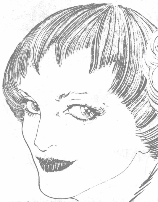
35 自然地按髮勢梳成短侍童式，前額頭髮剪成之字形，曲折不羈，別具一格。 Short page-boy with jagged fringe.