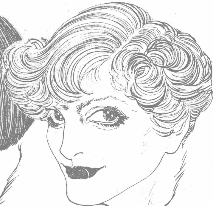
2 短髮型, 靠側分界, 兩鬢部分髻曲。 豐容雅量, 風姿可人。 Hair is cut short, and permed for volume on sides of head.