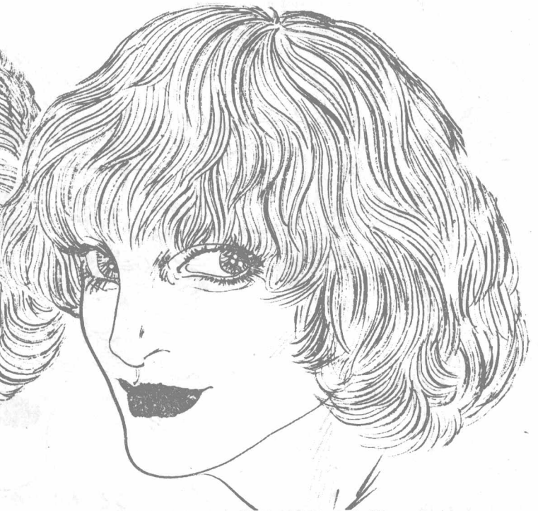
20 用輕淺電法電成微曲，髮長度中等，自然風乾後，呈野烈粗獷之狀。 Medium-length Coupe-Sauvage with gentle perming. Left to dry naturally.