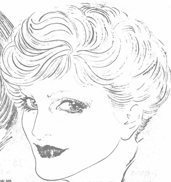
34 頂髮以緣邊層式修剪，兩側至後方作斜階狀。輕柔電曲，表現豐盈髮量。 Short cute style, lightly-permed for softness and movement.