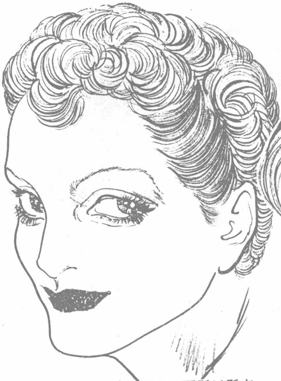
17 大量鬢曲之幽雅型式，兩鬢以髮夾直線地定止。 Cute short style with mass of curls.