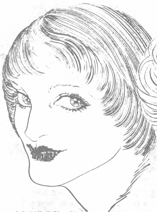
33 短侍童裝，劉海到兩鬢髮尾成疏絡狀，顯現朦朧的線條。 Short page-boy style, with soft face-framen.