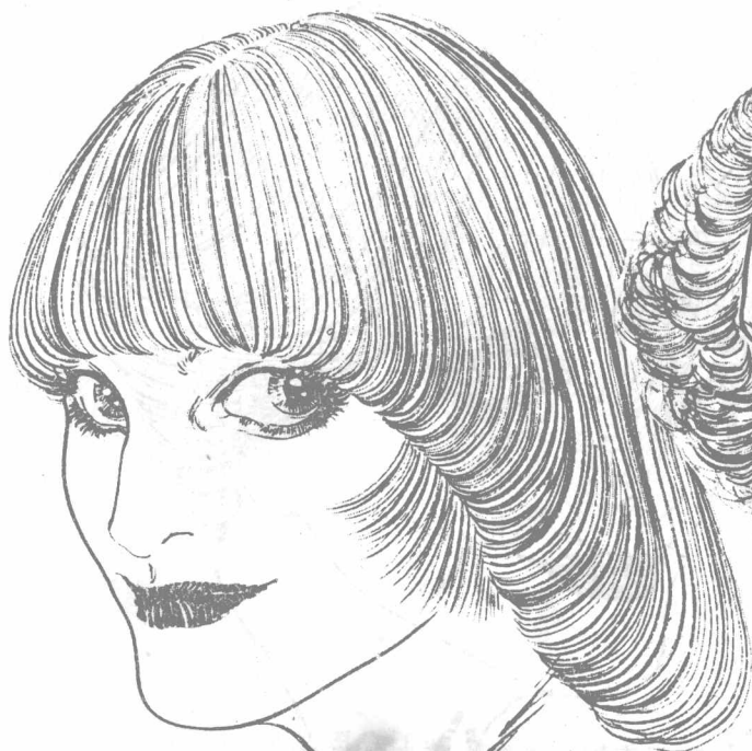
3 中長度侍童 (Page Boy) 型。髮 角一縷分束修剪, 增加魅力。 Beautiful page-boy with dramatic side- burns.