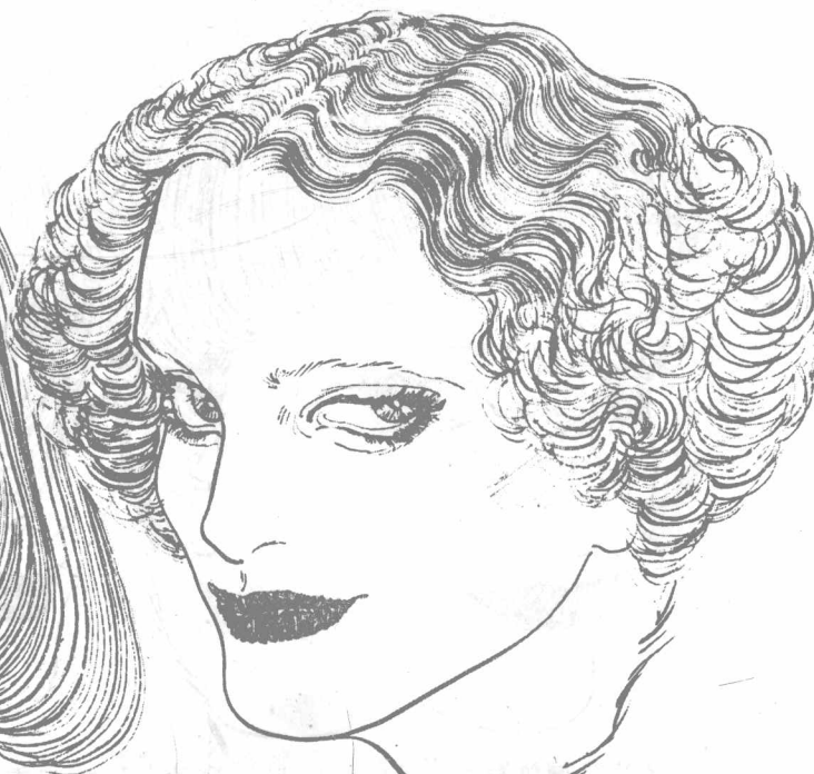
4 中分界, 向兩側作手指式捲髮電髮, 造成豐滿鬆柔的形狀。 Hair is gently waved from part into a fluffy sides.