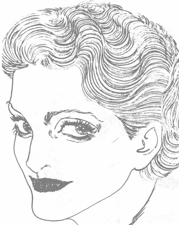
19 髮勢反覆鬢曲，向後宛轉呈流波形態，柔美標致。 Chic hair style, waved-away from the face design.