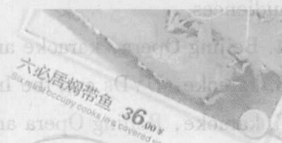
六心属的比鱼 36.00 ¥ Six heart-shaped fish