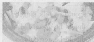
巧妇手撕包菜 16.00 ¥ The clever and dexterous woman hand rips the cabbage

tantalizing 非常着急的 boomerang 飞去来器;(喻)起反作用或产生意外的后果 dexterous 灵巧的