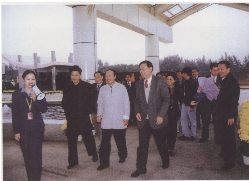
中国民用航空总局局长刘剑锋视察海航 Minister Liu Jianfeng of the CAAC conducts inspection of Hainan Airlines.