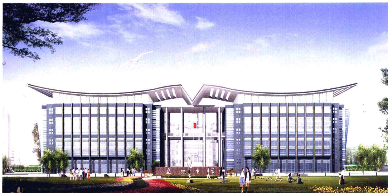
交城中学科技楼 Science and Technology Building of Jiaocheng Middle School