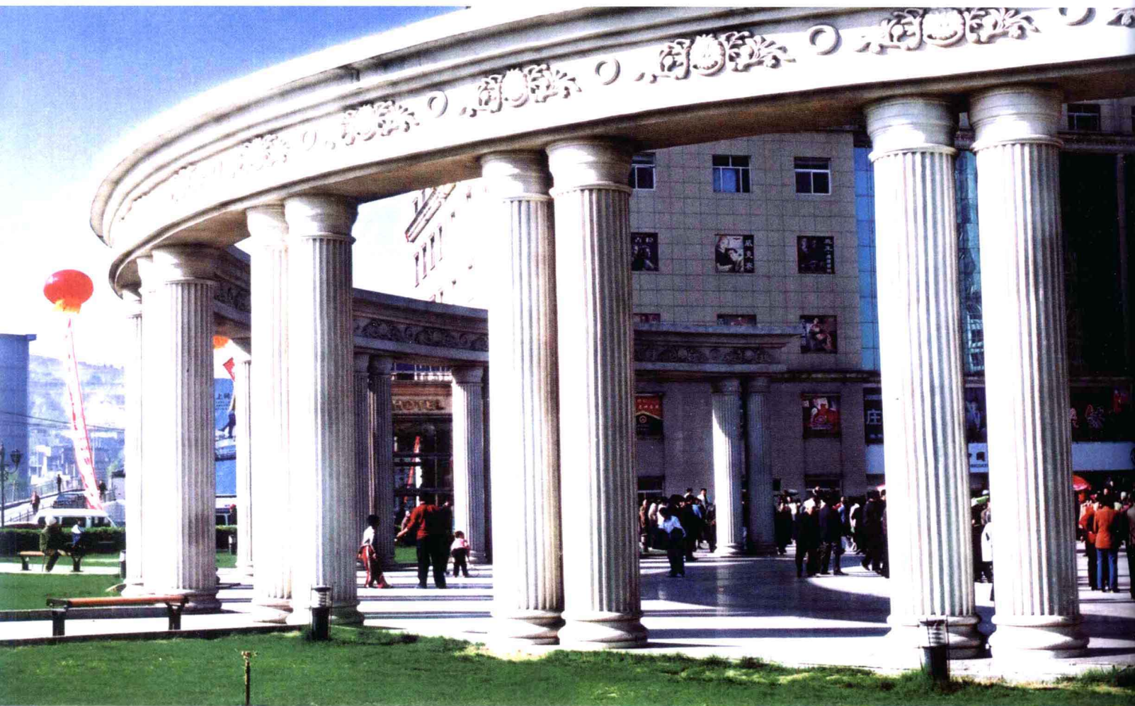
离石区世纪广场 Lishi District Century Square