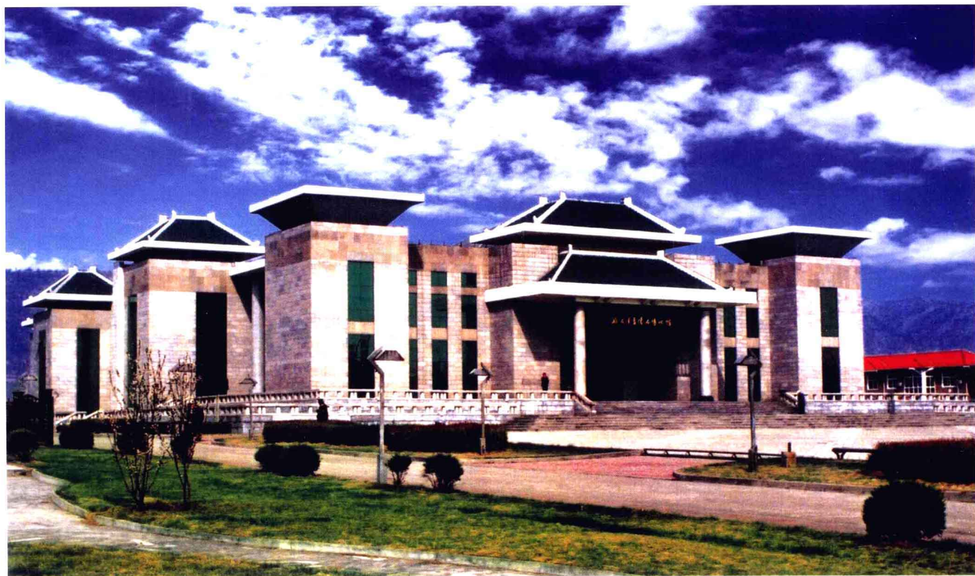
离石汉画像石博物馆 Lishi Han Portrait Stone Museum

Han portrait stone was the stone decoration portrait on building, tomb and stele of Han Dynasty. Luliang is the main Han portrait stone distribution area of our country. Lishi Han Portrait Stone Museum is a special-topic museum with Han portrait stone as basic display object, and in the main exhibition hall are displayed 79 pieces of superb products of Han portrait stone.