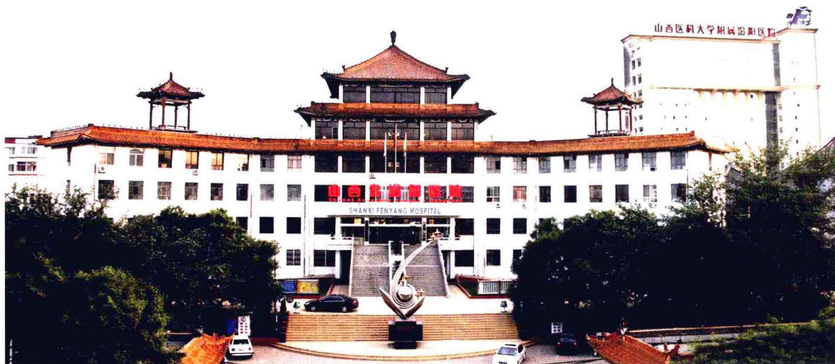
山西省汾阳医院 Shanxi Province Fenyang Hospital