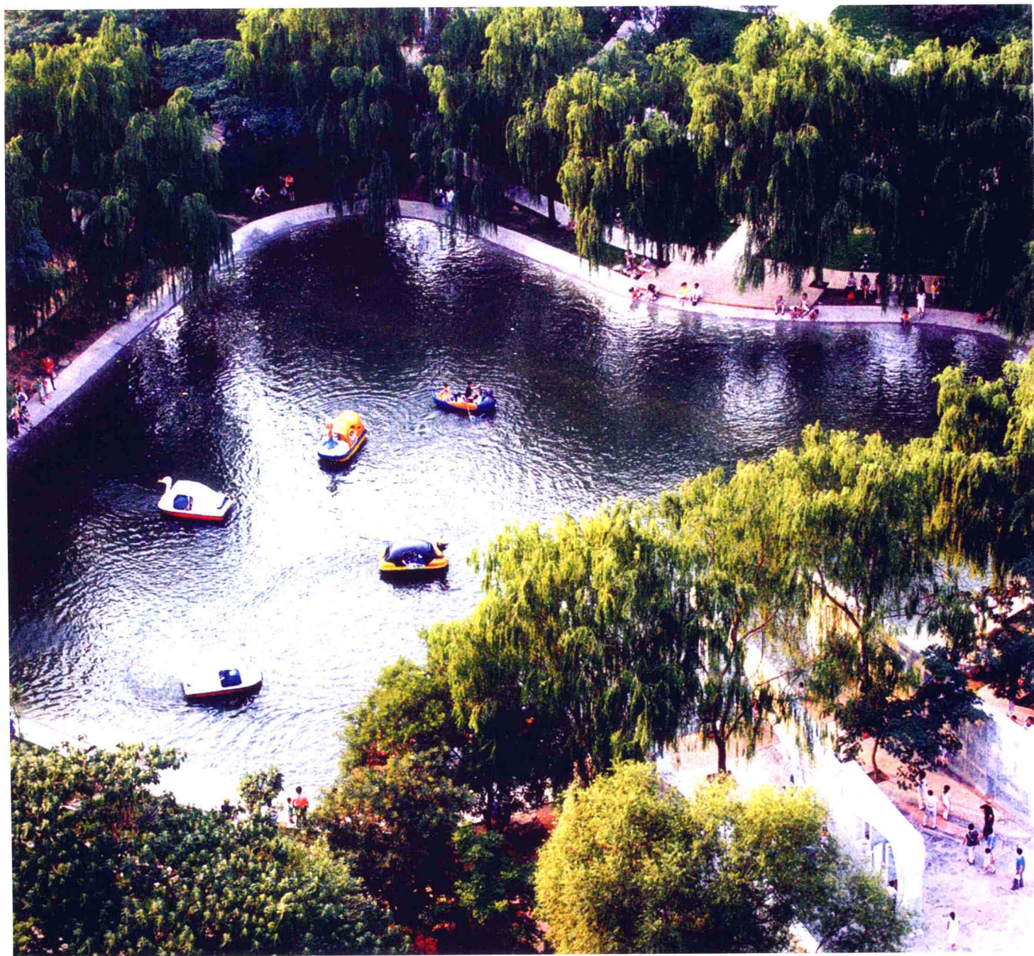
孝义市崇义园 Xiaoyi Chongyi Garden