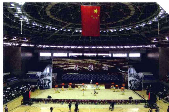
吕梁体育馆 Luliang Gymnasium