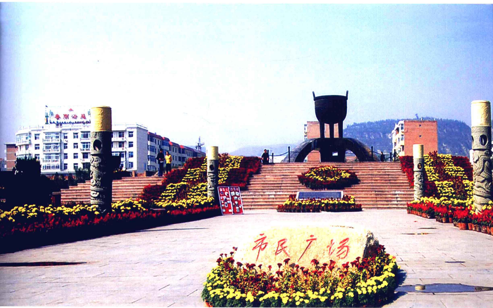
离石区市民广场 Lishi District City Resident Square