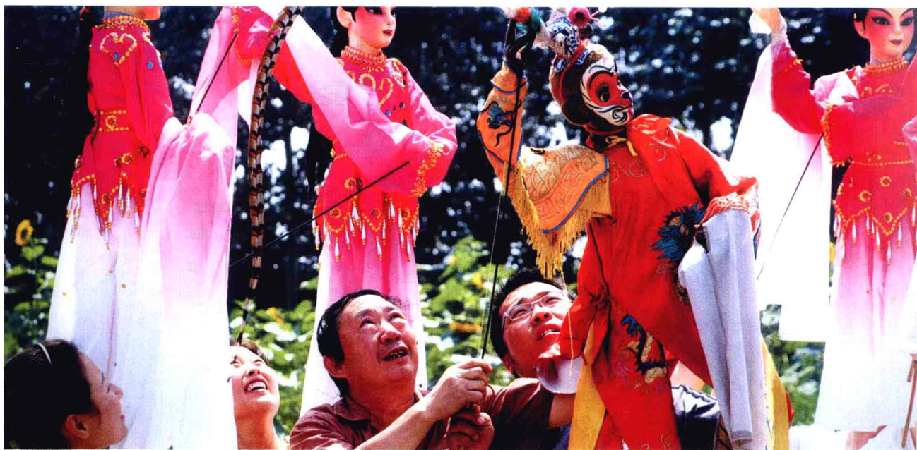
老艺人向青年演员传授技艺 Veteran entertainer imparts skill to young performer.

Xiaoyi puppet show originates from Song Dynasty and has a history of more than 800 years to now. The tune of song reserved the feature of traditional Wanwan Tune and, with folkways, folk custom and religious ceremony as manifestation contents. The character modeling is lifelike and imaged, the plot of story is full of twists and turns and the skill of performers is applauded as the best by the spectators. It is a gem with practical, decorative, collection and study value and was ranked among the second group of national-level non-material cultural heritage preservation projects.