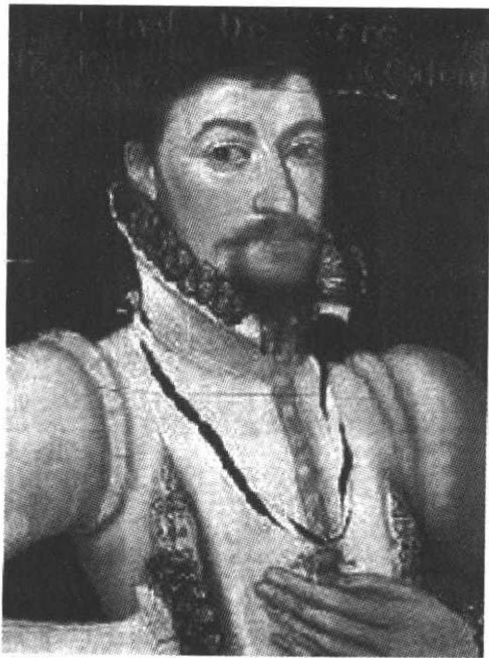
Portrait of Shakespeare