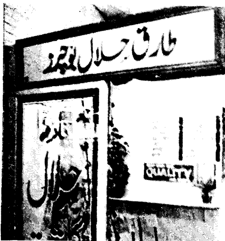
A Pakistani butcher's shop in London