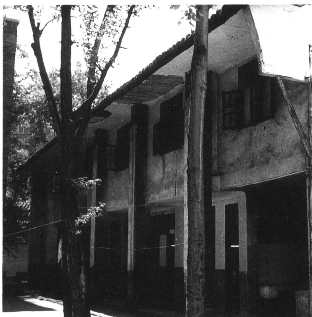
广安县高等小学堂旧址。1915年至1918年，邓小平在这里读高小。 The former place of the primary school of Guangan. From 1915 to 1918, Deng Xiaoping studied here.