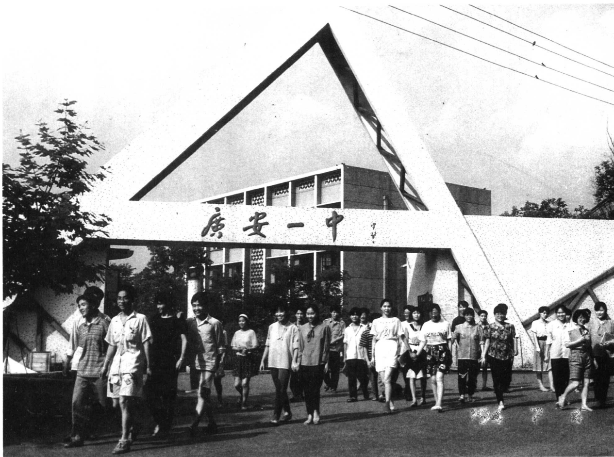
广安县立中学堂旧址(现为广安一中)。1918年邓小平在这里读中学。 The former middle school of Guangan County. (Guangan No. 1 Middle School now) In 1918 Deng Xiaoping studied in this school.