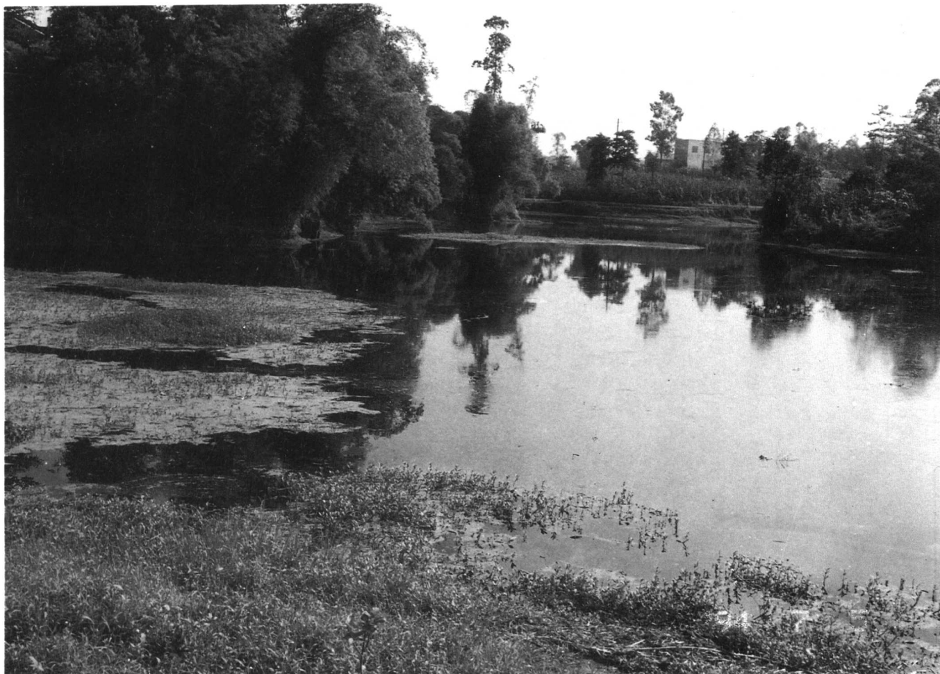
协兴乡牌坊水塘。邓小平童年时常在这里戏水、游泳。 The Paifang Pond in Xiexing Township. Deng Xiaoping often swam here in his childhood.