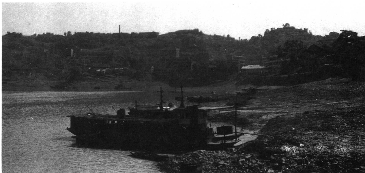
广安东门口码头。1918年邓小平从这里乘船去重庆。1919年,进入留法勤工俭学预备学校学习。 Guangan Dongmenkou Wharf. In 1918, Deng Xiaoping set for Chongqing by ship from here. He entered the preparatory school for the work-study programme in France in 1919.