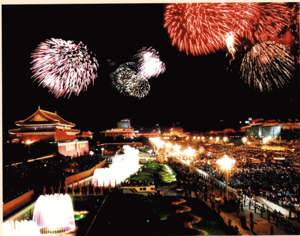
壮观的国庆之夜 A Magnificent Night View of the National Day