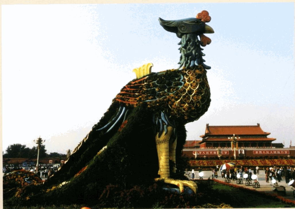
丹凤朝阳 The Magnificent Figure of A Propitious Phoenix