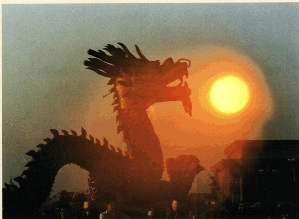
东方巨龙 The Gigantic Dragon of the East