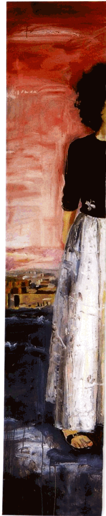
粉色天空 200 × 1