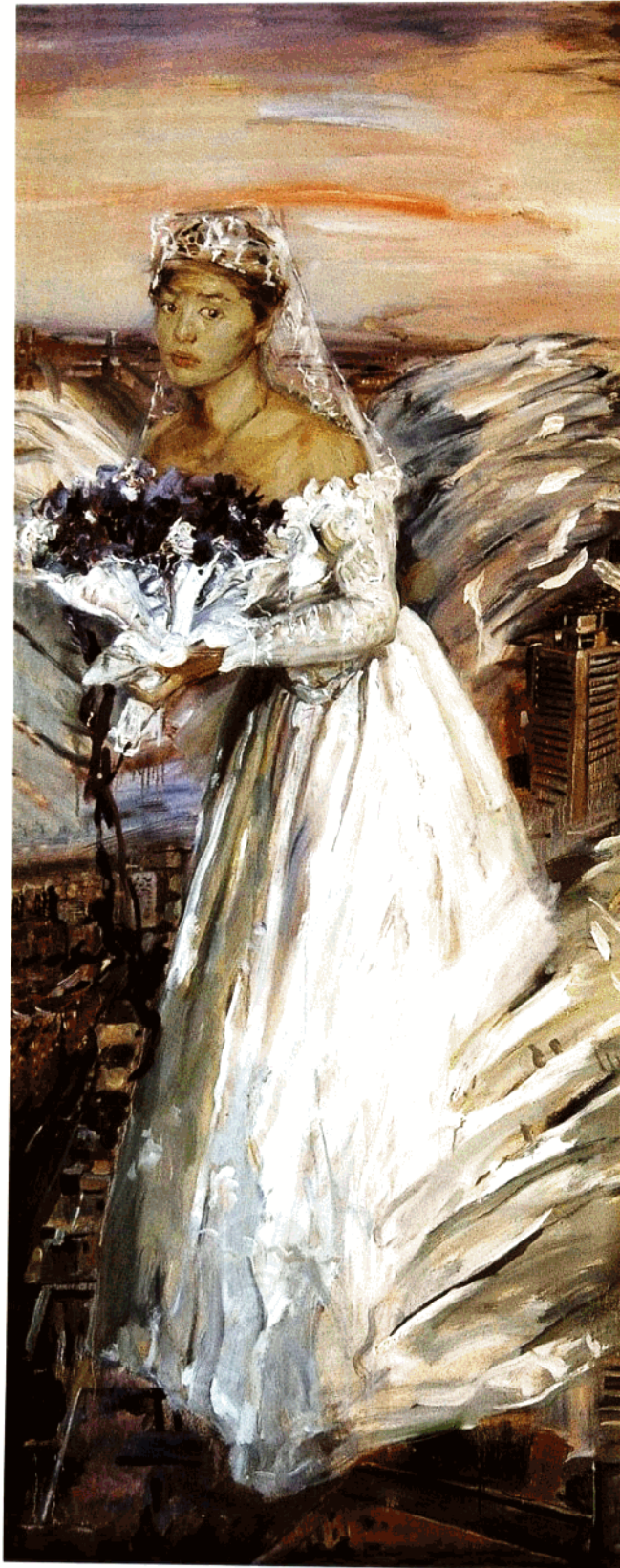
勿忘我 Don't Forget Me 200 × 100cm 1999