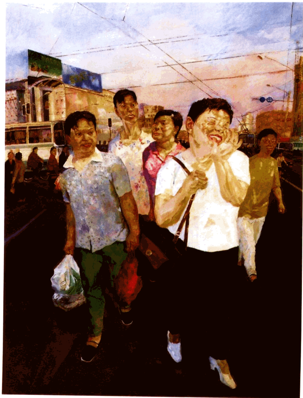
购物 Shopping 130 × 100cm 2000