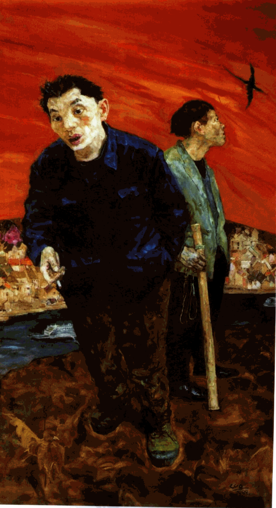
鸟·人 (1) Birds Men 170 × 100cm 1999