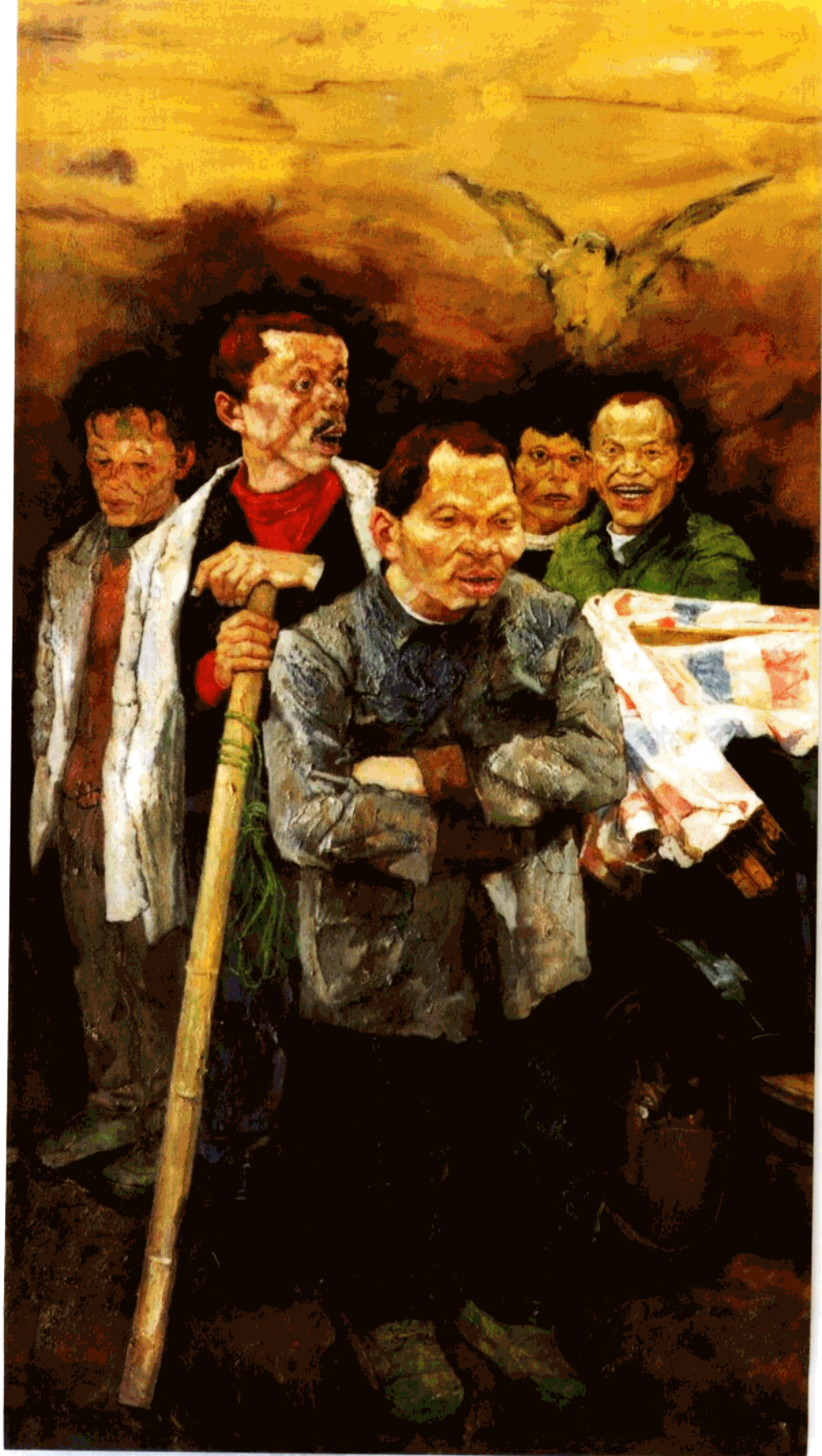
鸟·人(2) Birds Men 170 × 100cm 1999