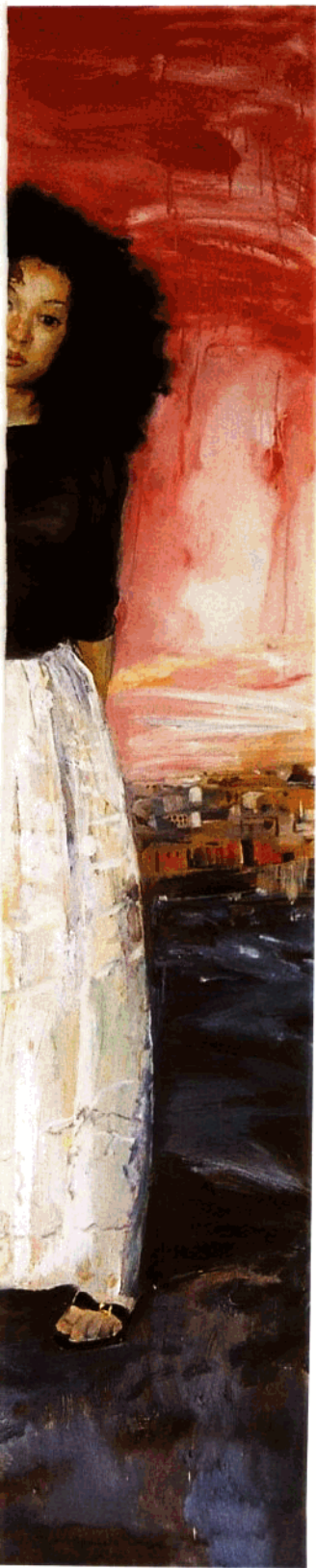
Pink Sky 100cm 1999