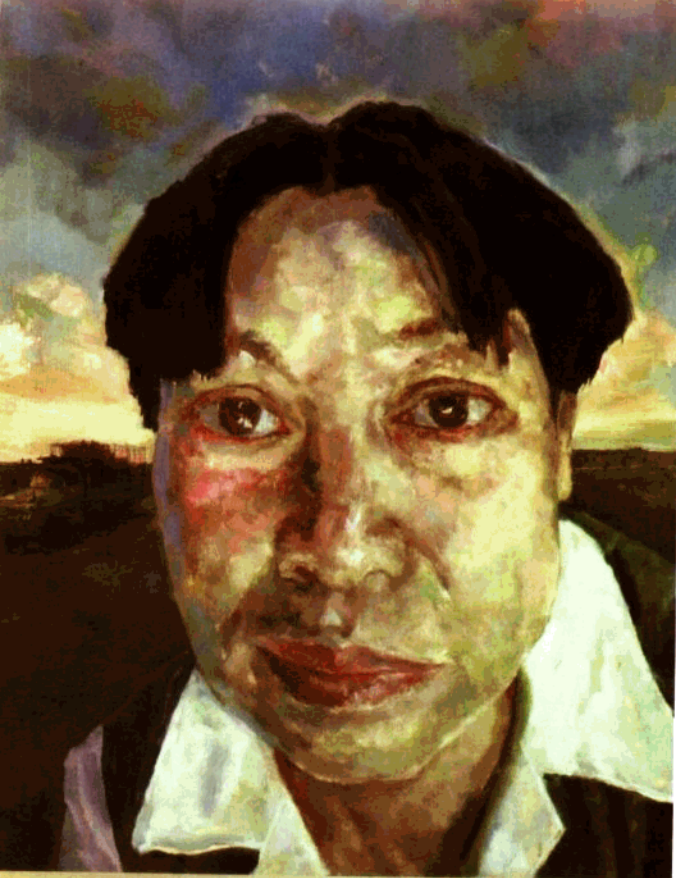
汾阳 Fenyang 130 × 100cm 2000