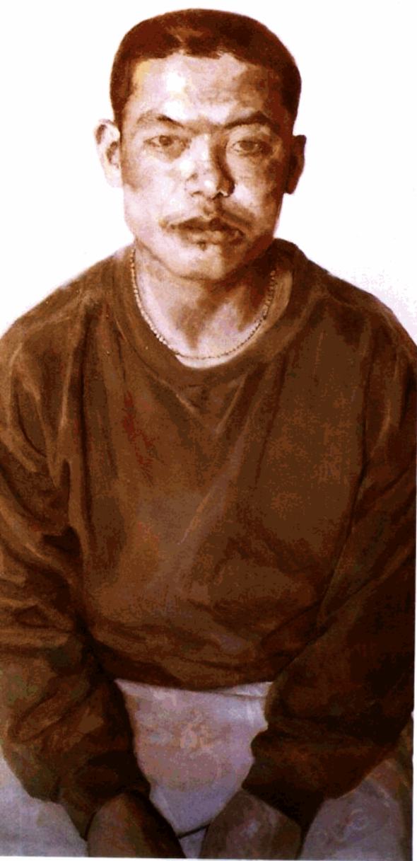
兄弟 Brother 145 × 116cm 2000