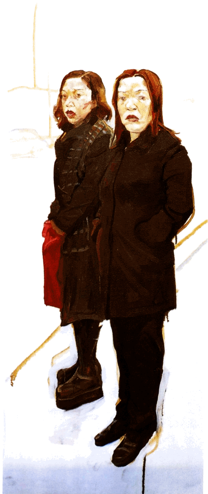
十字路口 Crossing-road 145 × 58cm 2001