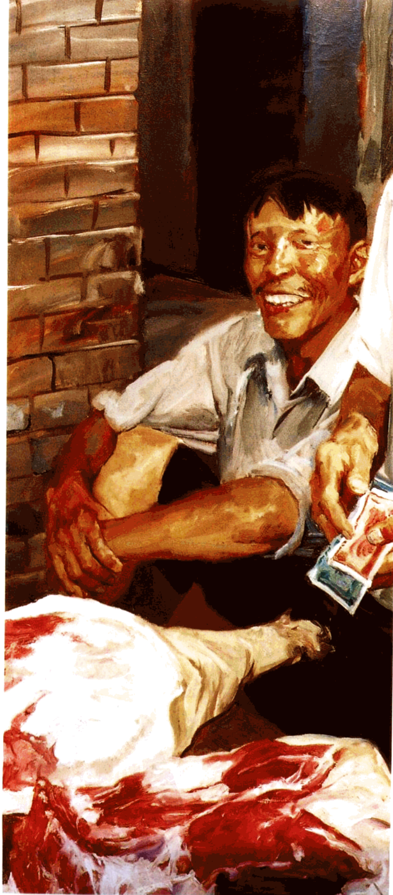
卖肉 Saling Meat 145 × 58cm 2001