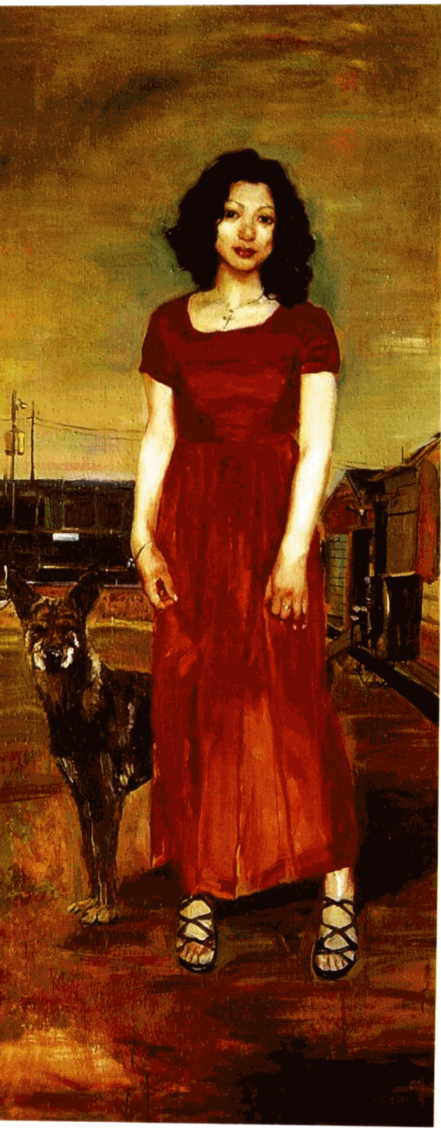
红裙子 A Girl with Red Skirt 200 × 100cm 1999