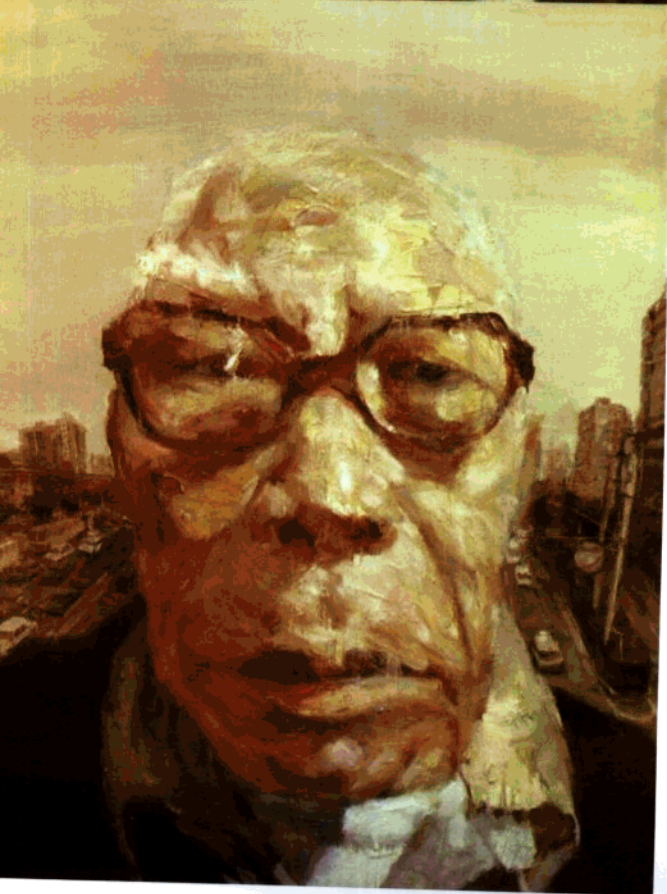
安定门 An ding pass 130 × 100cm 2000